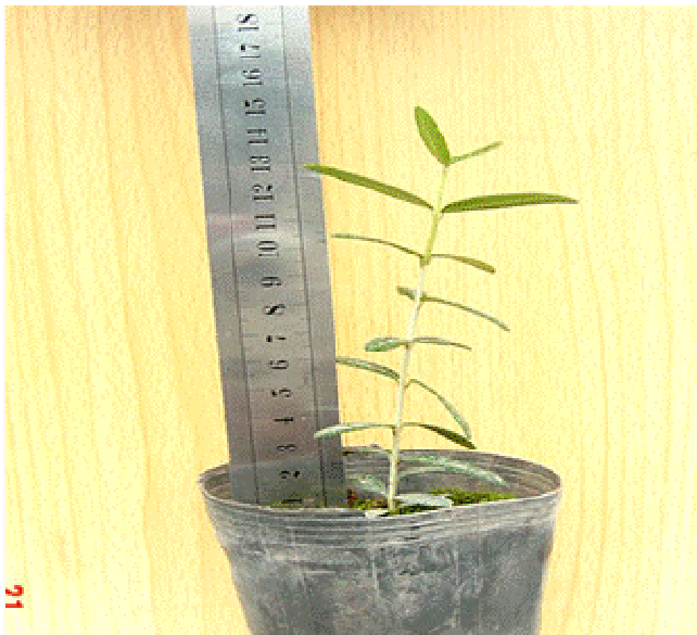
Figure 4. Successfully acclimatized plant.

together on root growth of GF 677 was also found by Tsipouridis et al. (2006).