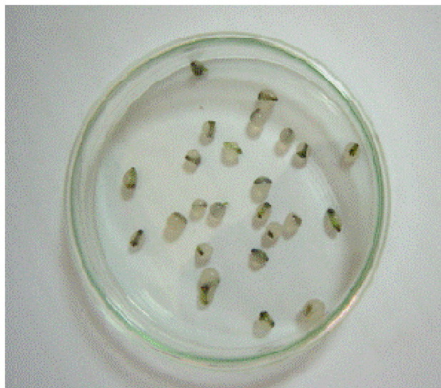
Figure 1. Prepared synthetic seeds.

germplasm are prerequisites for synthetic seed technology and its commercial application. In addition, development of appropriate storage techniques is also obligatory for successful conversion of the synthetic seeds of clonal germplasm of elite and endangered cultivars in the near future (Maruyama et al., 1997). The use of synthetic seeds for obtaining plants has been reported for several crops of economic interest (Redenbaugh et al., 1987; Gray and Purohit, 1991) but for only very few woody species (Rao and Bapat, 1993; Lulsdorf et al., 1993). Keeping in view all these aspects, the present study was therefore undertaken to (1) Study the effect of cold and room storage at different storage intervals on survival, proliferation and conversion abilities of synthetic seeds; (2) formulate a protocol and composition of nutritive medium for room storage in subsequent experiments as energy is a big crises for storage of synthetic seeds into freezer/refrigerator in developing countries.