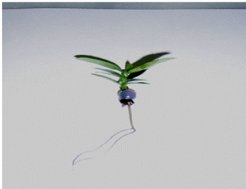
Figure 3. The plant with maximum root length (4 cm) obtained from a synthetic seed for 45 at 4°C.