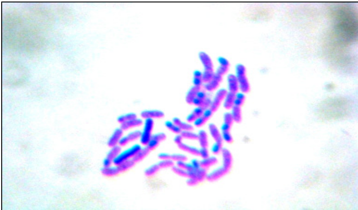
Figure 1. K4 stained with endospore stain (total magnification: 1000X).