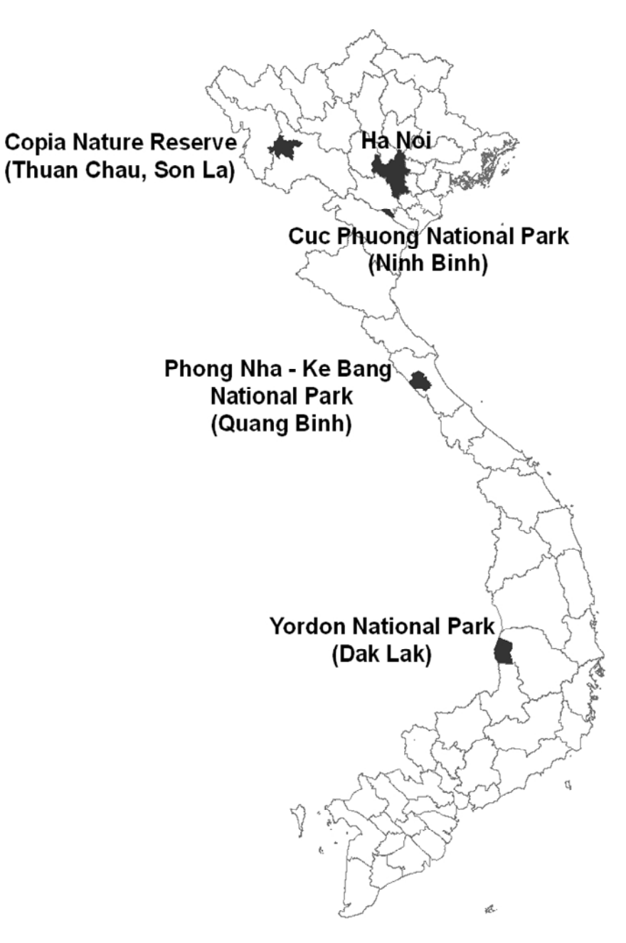
Figure 1. Location of the three Dalbergia species in the Vietnam.