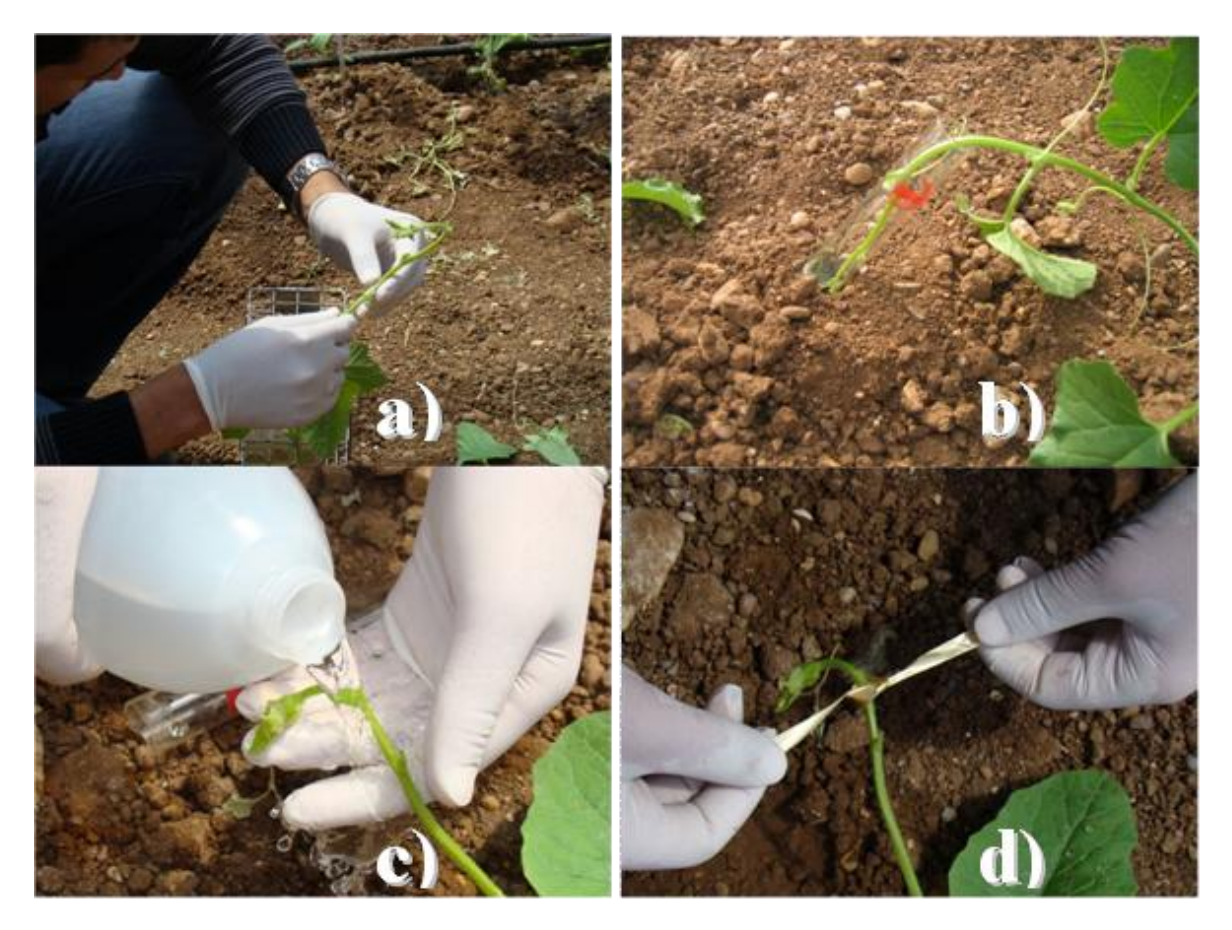
Figure 2. In vivo colchicine application steps: a) Stripping of the leaves and tendrils of apex. b) Dipping apex into colchicine solution. c) Washing apex with water. d) Labeling application point with rope.