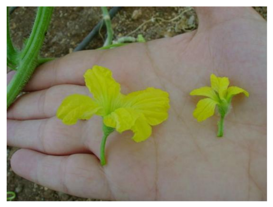
Figure 3. Male flower of dihaploid and haploid melon plant.