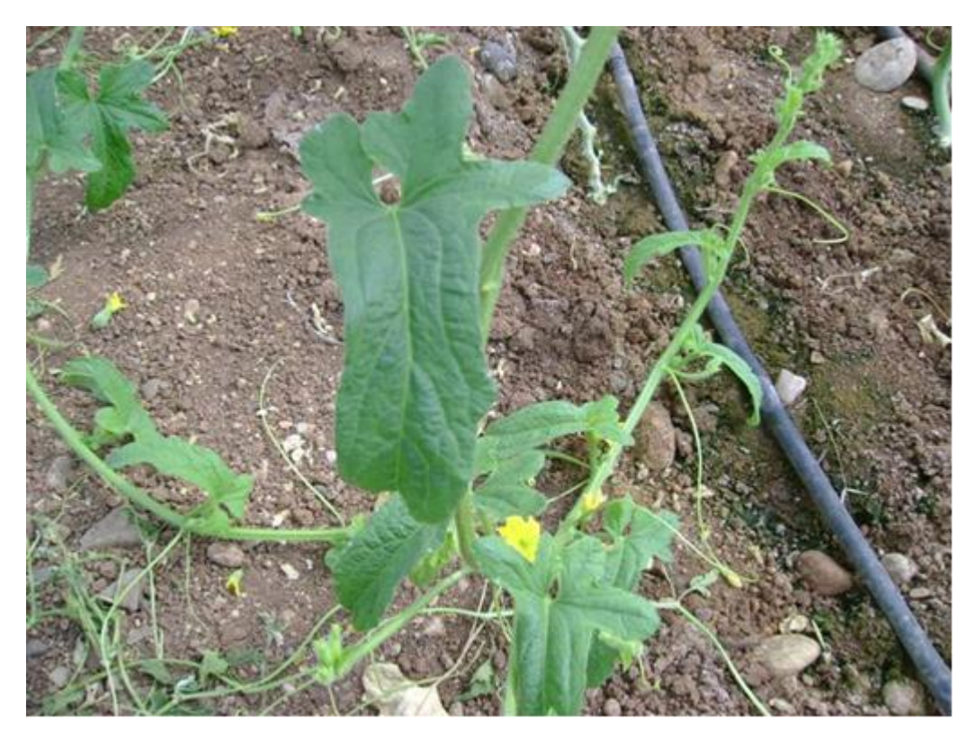
Figure 4. Abnormal leaf shape of haploid melon plant.