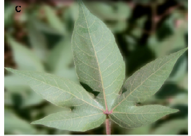
Figure 1. Variable classes in leaf types (a) Normal leaf (b) Okra leaf (c) Sub-okra leaf.