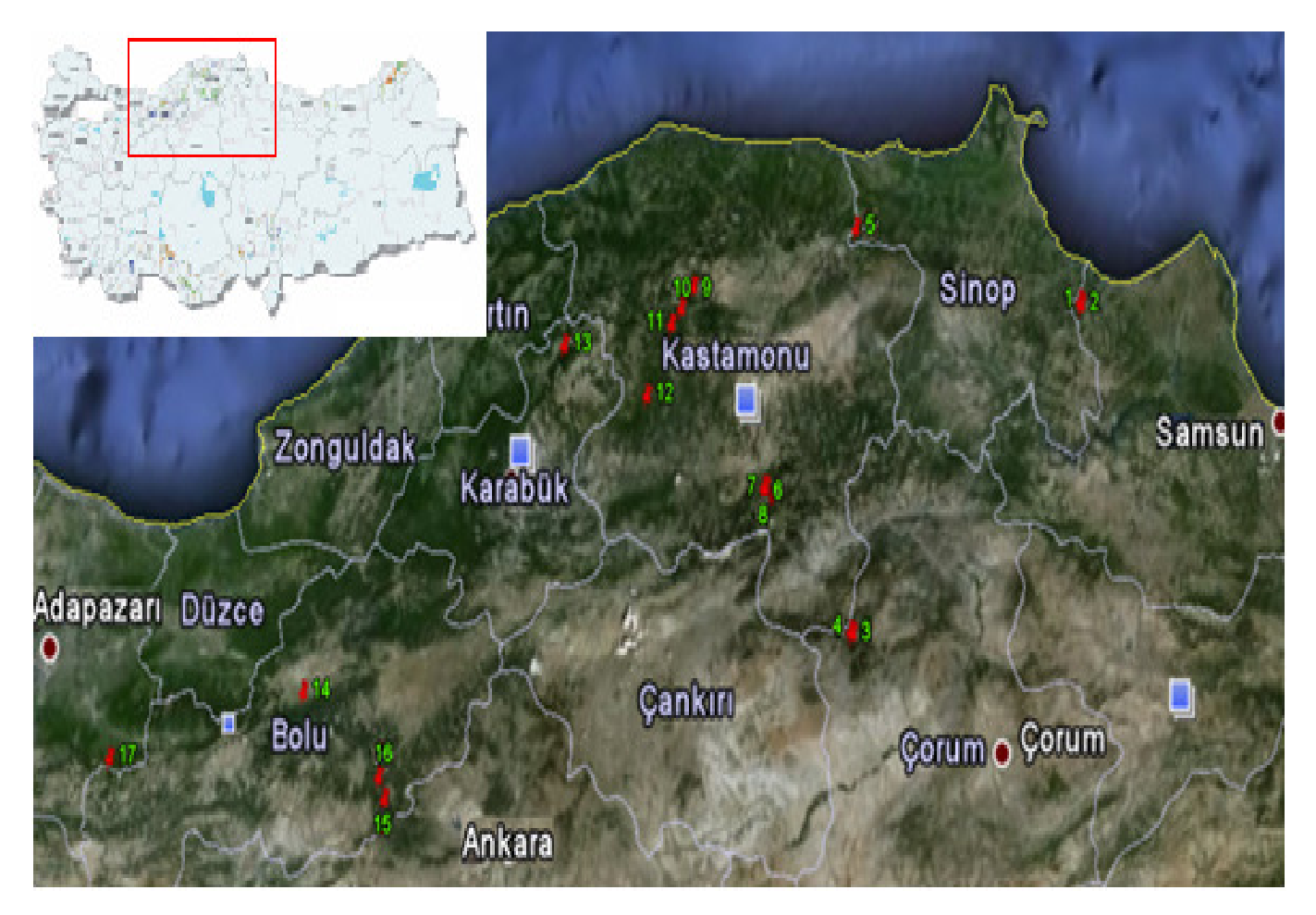
Figure 1. Locations of the populations.

different natural populations of Turkish fir in Western Black Sea region. Location and description of the studied populations are presented in Figure 1 and Table 1, while seeds were sown at seed beds of 0.5 cm depth in February. Seeds were sown in river sand (10%), forest soil (30%) and peat (60%), respectively and covered with perlite and snow. At the end of the vegetation period, morphological features were measured for 1 year old seedlings. After 1 year, morphological features were measured again for 2 years old seedlings.