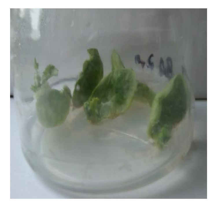
Figure 1. Citrullus lanatus cv. Zaojia cotyledons without precultivatio n