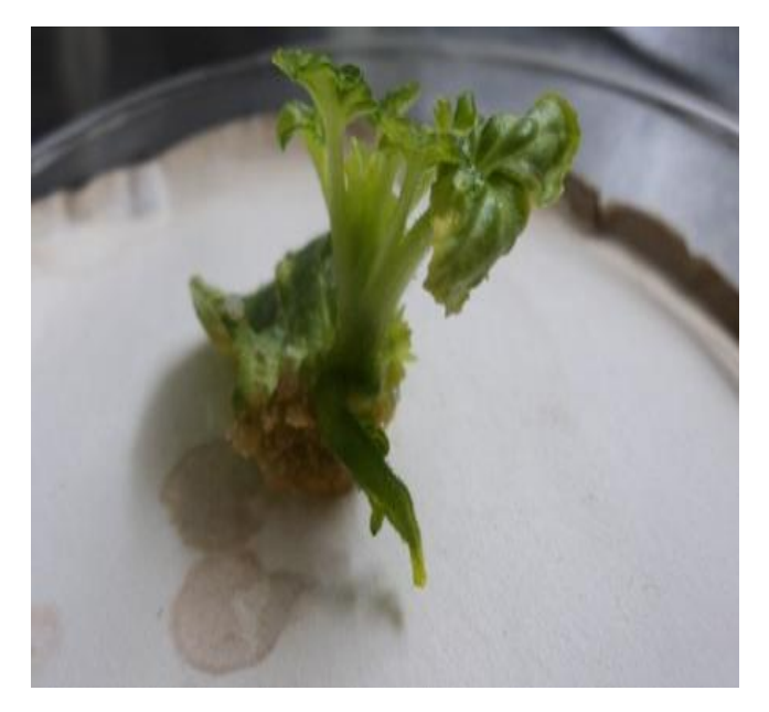
Figure 3. Citrullus lanatus cv. Zaojia transformed shoots with T-DNA.

The PCR is a sensitive technique allowing single-copy genes to be amplified and extracted out of a complex mixture of genomic sequence (Innis and Gelfand, 1990). PCR was utilized in this investigation for rapid screening of Pti4 gene explants. Total genomic DNA was isolated from explants of putative transformants. DNA of non-transformed explants was used as a negative control and DNA of pRD400 (isolated from Agrobacterium strain EHA105) was used as a positive control as shown in Figure 5. A designed primer specific to Pti4 gene was used for PCR amplification and a PCR product with a size of about 680 bp was amplified. The genomic DNA of