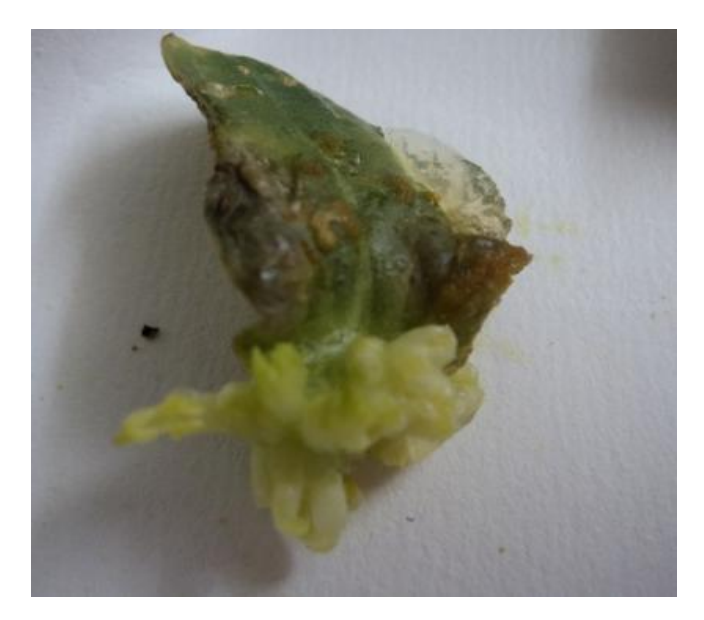
Figure 2. Citrullus lanatus cv. Zaojia untransformed shoots on medium containing kanamycin.

of eight and seven transgenic shoots respectively (Table 4). These results indicate that some shoots failed to integrate the foreign gene but was bleached on the selected medium containing kanamycin (Figure 2). Ibrahim et al. (2009) study showed that no survived (100% mortality) explants were observed when 100 mg/l kanamycin was used in all types of explants. These results are in line with Raharjo et al. (1996) who found that kanamycin-resistant embryogenic calli were used to initiate suspension cultures (in liquid MS medium with 1.0 µM 2,4-dichlorophenoxyacetic acid (2,4-D)/BA, 50 mg/l kanamycin) for multiplication of embryogenic cell aggregates. Joung et al. (2001) reported that kanamycin was used for the selection of putative transformants. The minimum concentration of kanamycin required to kill nontransformed leaf explants of Campanula was 50 mg/l, and death of explants occurred after three months of culture.