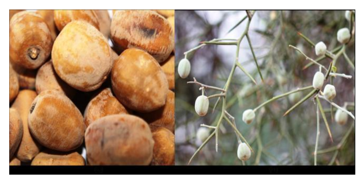
Figure 1. Immature (a) (January 2011) and mature fruits (b) of Balanites aegyptiaca (L.) Del. This has been changed to brownish.