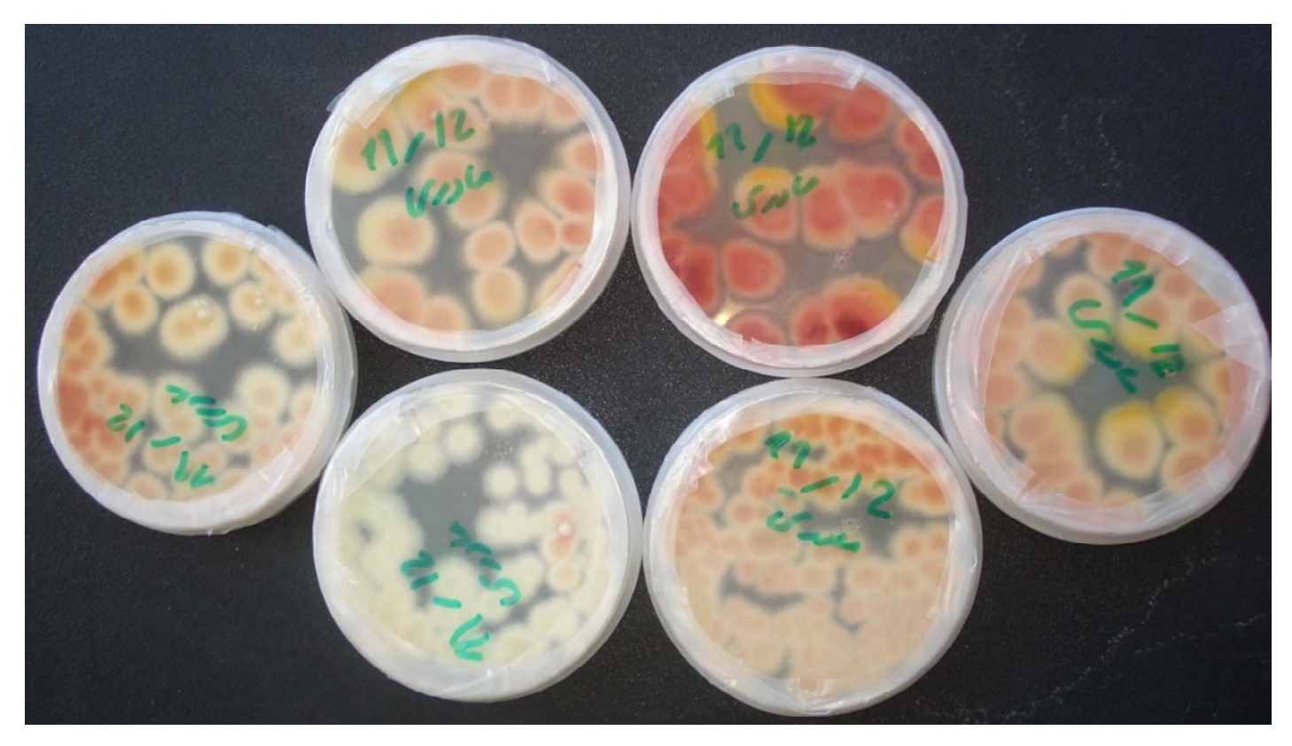
Figure 1. Monacus purpureus ATTC 1603 cultivated on potato- dextrose agar for 10 days at 37°C.