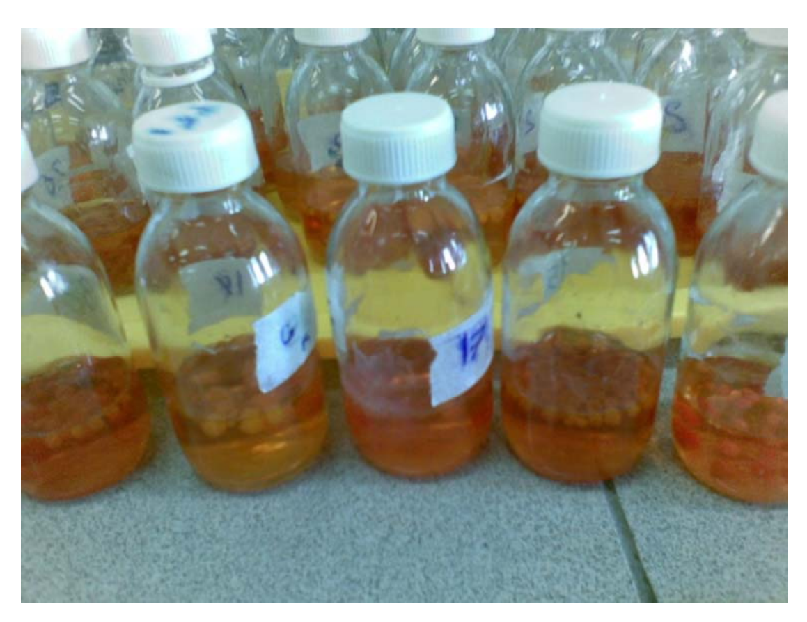
Figure 2. Extracellular pigment production with various zinc, gibberellic acid, vitamin B<sub>2</sub>, amino acids (glycine and L-leucine) concentration in liquid media.

advantages that include fewer experiment numbers, suitability for multiple factor experiments, search for relativity between factors, and finding of the most suitable condition and forecast response (Popa et al., 2007; Panda et al., 2009). This facilitates the determination of optimum values of the factors under investigation and prediction of response under optimized conditions (Panda et al., 2009; Chakravarti and Sahai, 2002).