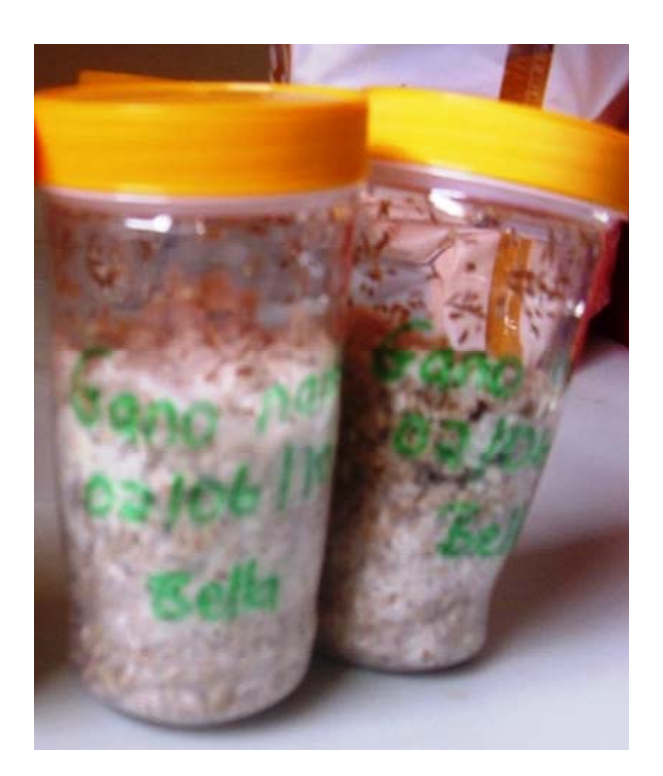
Figure 2. Pure spawn.