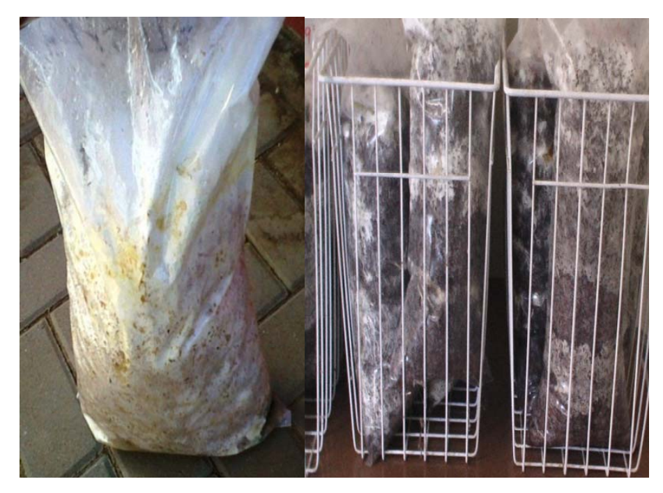
Figure 3. Corncobs (L) and sawdust (R) growing in bags.