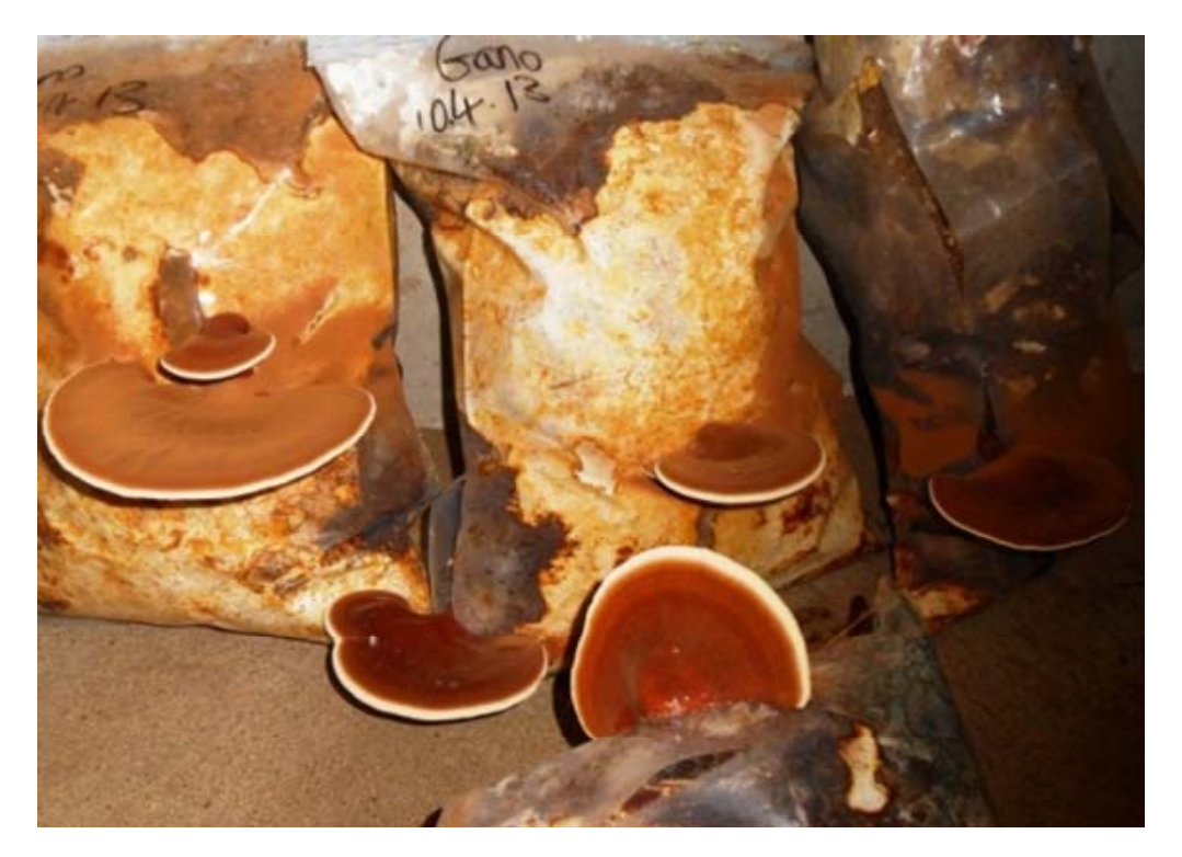
Figure 4. Ganoderma growing on maize cobs.

with nutrients to support growth of the basidiocarp. It is also recommended that quality assurance tests be done on the mushrooms obtained to ensure that their bioactive compound content are the same as mushrooms