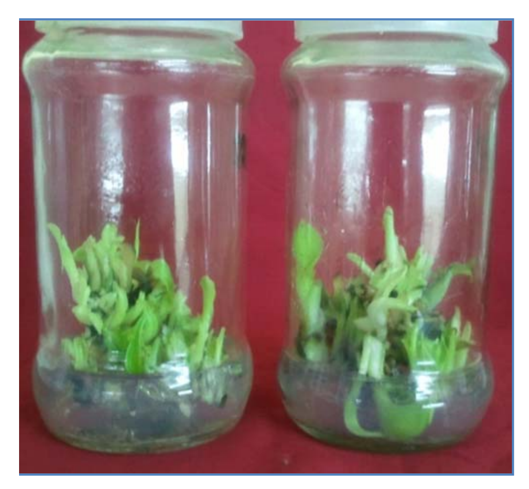
Figure 3. Culture proliferation of banana explants cv. Grand Naine.

Values in bracket indicate that they are transformed values. Data recorded for different parameters were subjected to completely randomized design (CRD). Statistical analysis by (ANOVA) technique of CRD software used for data analysis is O.P. State.