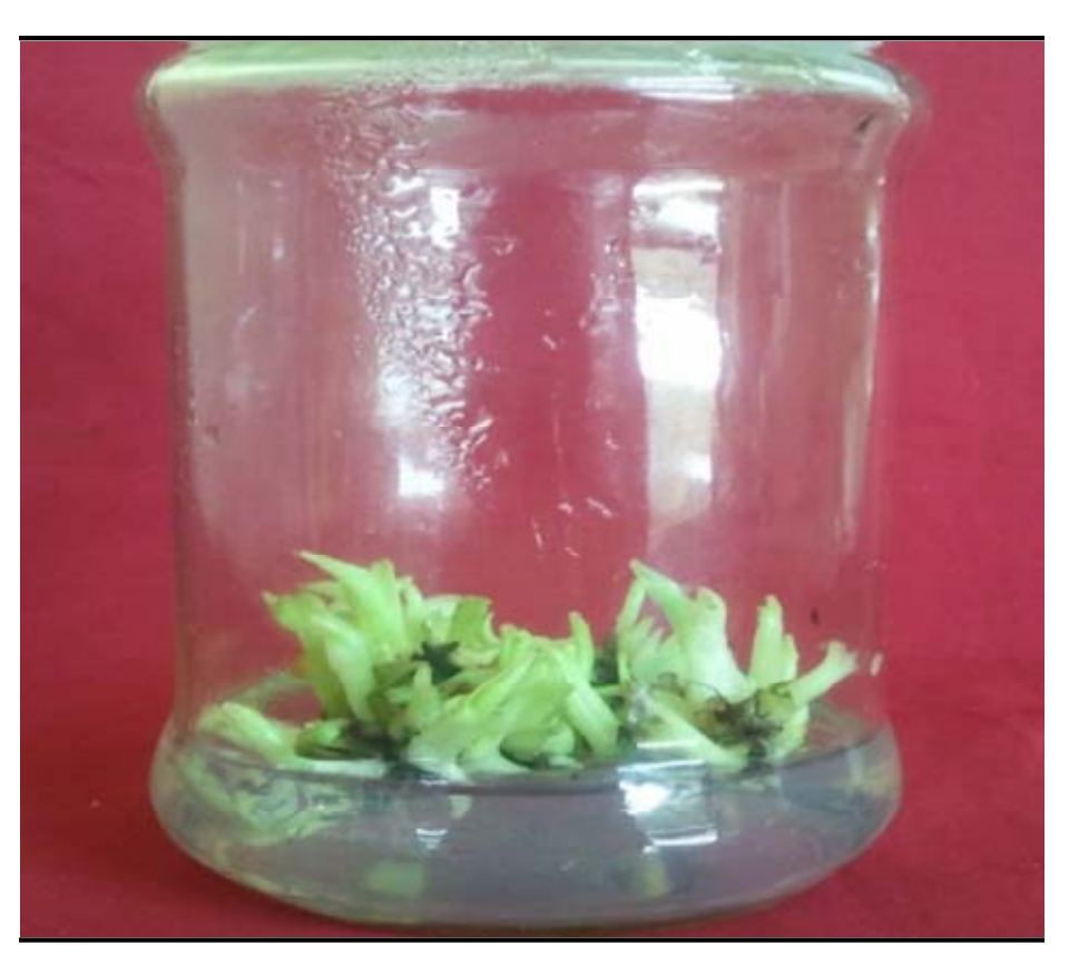
Figure 2. Culture establishment of banana explants cv. Grand Naine.

Values in bracket indicate that they are transformed values. Data recorded for different parameters were subjected to completely randomized design (CRD). Statistical analysis by (ANOVA) technique of CRD software used for data analysis is O.P. State.