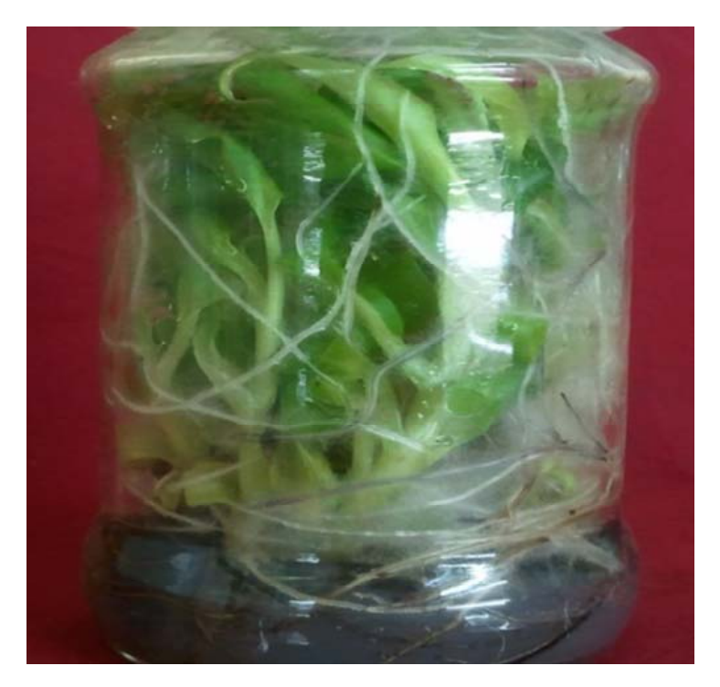
Figure 4. In vitro rooting.

tried, only 3 treatments (MS half strength) with IBA (1.00 mg/l) and activated charcoal showed maximum rooting of cultures (98.66%) which was at par with MS (half strength) with IBA (1.00 mg/l) and NAA (0.50 mg/l) registering 95.33% rooting. However, the shootlet took least time (6.33 days) for root initiation on half strength MS medium supplemented with 1.00 mg/l IBA and 200 mg/l activated charcoal. The maximum number of roots per shootlet (6.66) and the maximum length of root (7.80 cm) was produced on the medium containing 1.00 mg/l IBA and 200 mg/l activated charcoal. Treatments MS (half strength) augmented with 1.00 mg/l IBA and activated charcoal supported the maximum length of shoot (7.40 cm), which was significantly superior to the rest of the treatments tested. Considering the leaves per shoot, the maximum number of leaves (6.33) were produced on MS (half strength) supplemented with 1.00 mg/I IBA and activated charcoal. Addition of activated charcoal avoids callus formation at the base of the shoot before rooting.