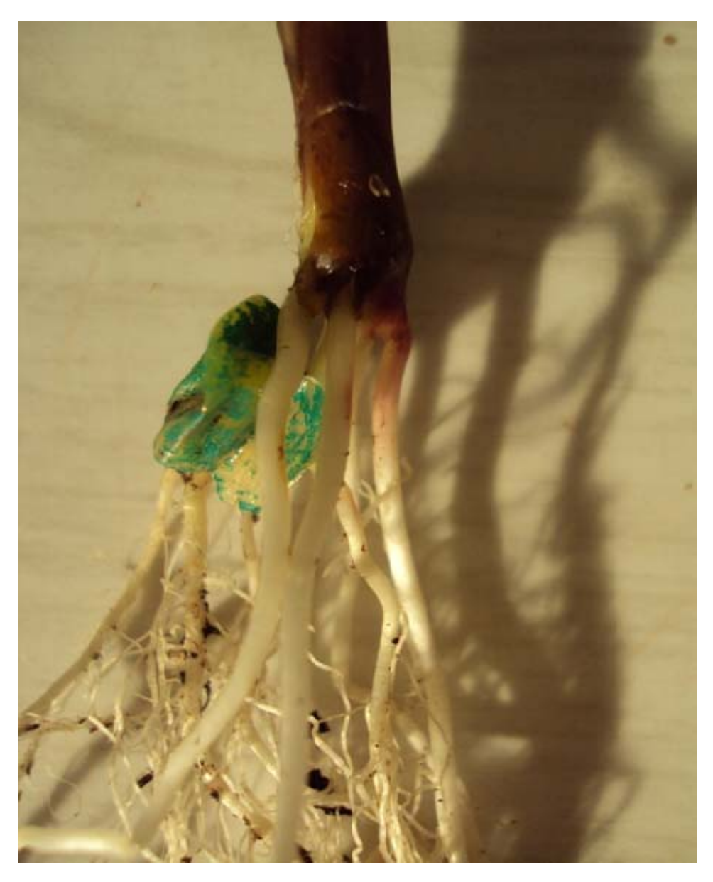
Figure 2. Corn root system (very strong) 30 days after emergence.

plants when it was grown in mixed stand with both sorghum and millets (corn + sorghum + millets) was probably due to the reduction in the growth and total dry weights of millets and sorghum and also there was no strong intra plants competition among the corn plants in the mixed stand.