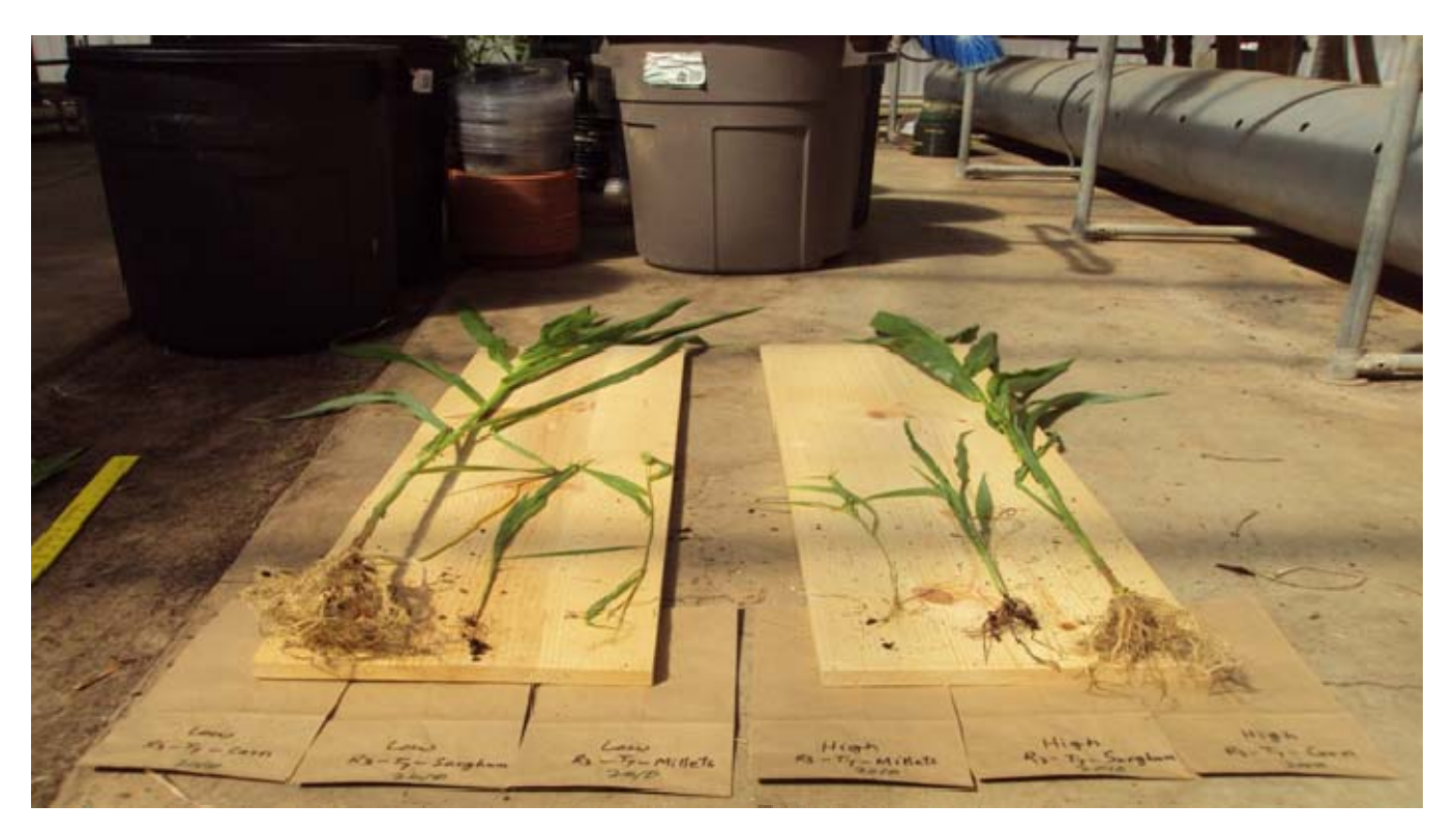
Figure 10. Corn, grain sorghum and foxtail millets grown together in mixed stand under low (Left) and high (Right) water level 90 days after emergence.