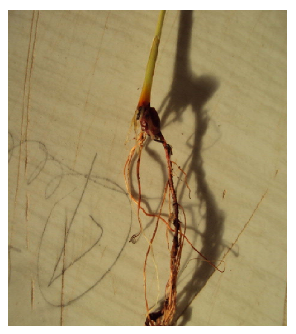
Figure 3. Grain sorghum root system (strong) 30 days after emergence.

plants in the mixed stand was better established than that of sorghum and millets, and therefore, corn plants probably may have took more nutrients and water than the two crops. According to Casper and Jackson (1997) the below-ground competition for water and nutrients can be stronger and can involve more neighbors than aboveground competition.