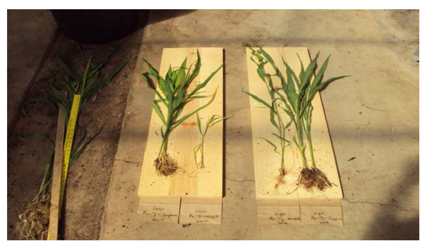
Figure 9. Grain sorghum and foxtail millets grown together in mixed stand under low (Left) and high (Right) water level 90 days after emergence.