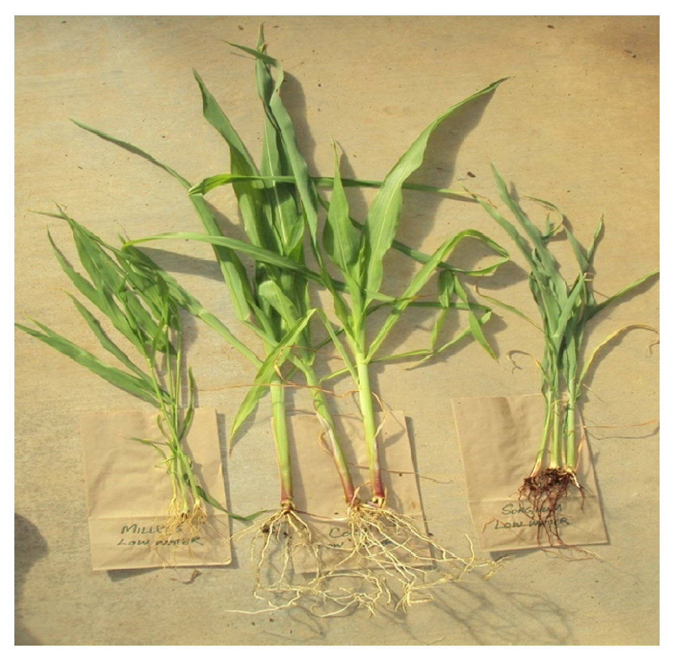
Figure 5. Millets (Left), corn (Middle) and grain sorghum (Right) shoot and root growth 60 days after emergence under low water level.

Stewart, 2013)). The increase in the CGR of sorghum when it was grown alone in pure or mixed stand with millets (Figure 9) was due to the increase in shoot and root dry weights of sorghum. But the higher leaf area and root dry weights of corn plants in the mixed stand with sorghum (corn + sorghum or corn + sorghum + millets) had negative influence on the shoot and root dry weights of sorghum (Figures 7 and 10) which resulted in the lower CGR of sorghum plans. Rubio et al. (2001) reported that competition among plants occur both above- and below-