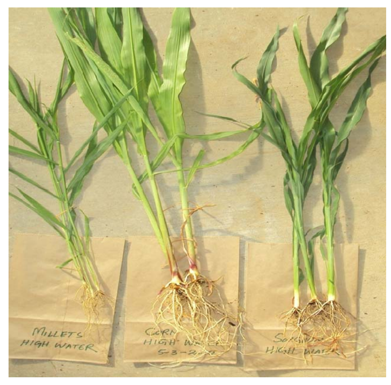
Figure 6. Millets (Left), corn (Middle) and grain sorghum (Right) shoot and root growth 60 days after emergence under high water level.

emergence at low than at high water level. According to Sadras and Calderini (2009), there has been emerging evidence of the importance of early crop vigor for competitive ability of crop plants. At the early growth stage, millets reduced its plant heights; leaf area and shoot dry weight when it was grown in mixed stand with both crops (Figure 1) that declined the CGR in millets plants. The higher leaf, stem and root dry weight of millets when it was grown mixed with sorghum (sorghum