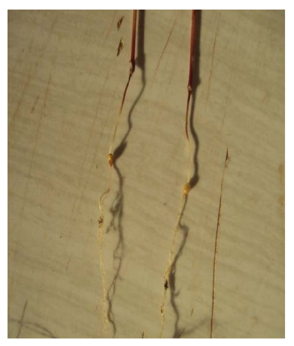
Figure 4. Foxtail millets root system (weak) 30 days after emergence.

vigor for competitive ability of crop plants. Likewise corn plants, the lower CGR of sorghum at high than at low water level was attributed to the negative effects of high water level on plant height, root length, leaf area, shoot and root dry weights of sorghum (Amanullah and Stewart, 2013) at 60 DAE. According to Sadras and Calderini (2009), plant height tend to be the most common shoot trait implicated in competitive ability of different crops. The increase in the CGR of sorghum when it was grown alone in pure or mixed stand with millets (sorghum + millets) was due to the increase in shoot and root dry weights of sorghum (Figures 3 and 4). But including corn in the mixtures with sorghum (corn + sorghum or corn + sorghum + millets) had negative impacts on both shoot