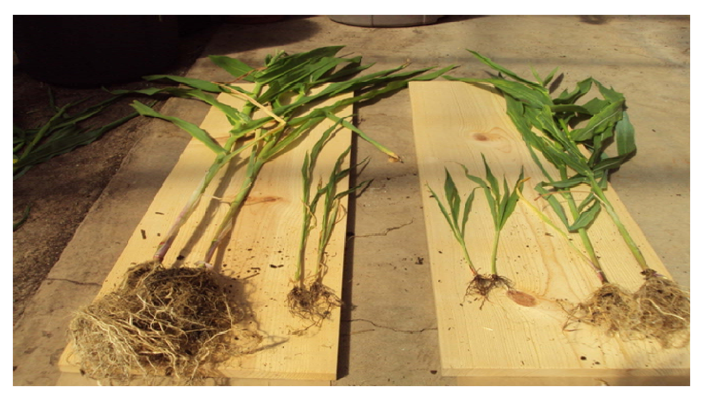
Figure 7. Corn and grain sorghum grown together in mixed stand under low (Left) and high (Right) water level 90 days after emergence