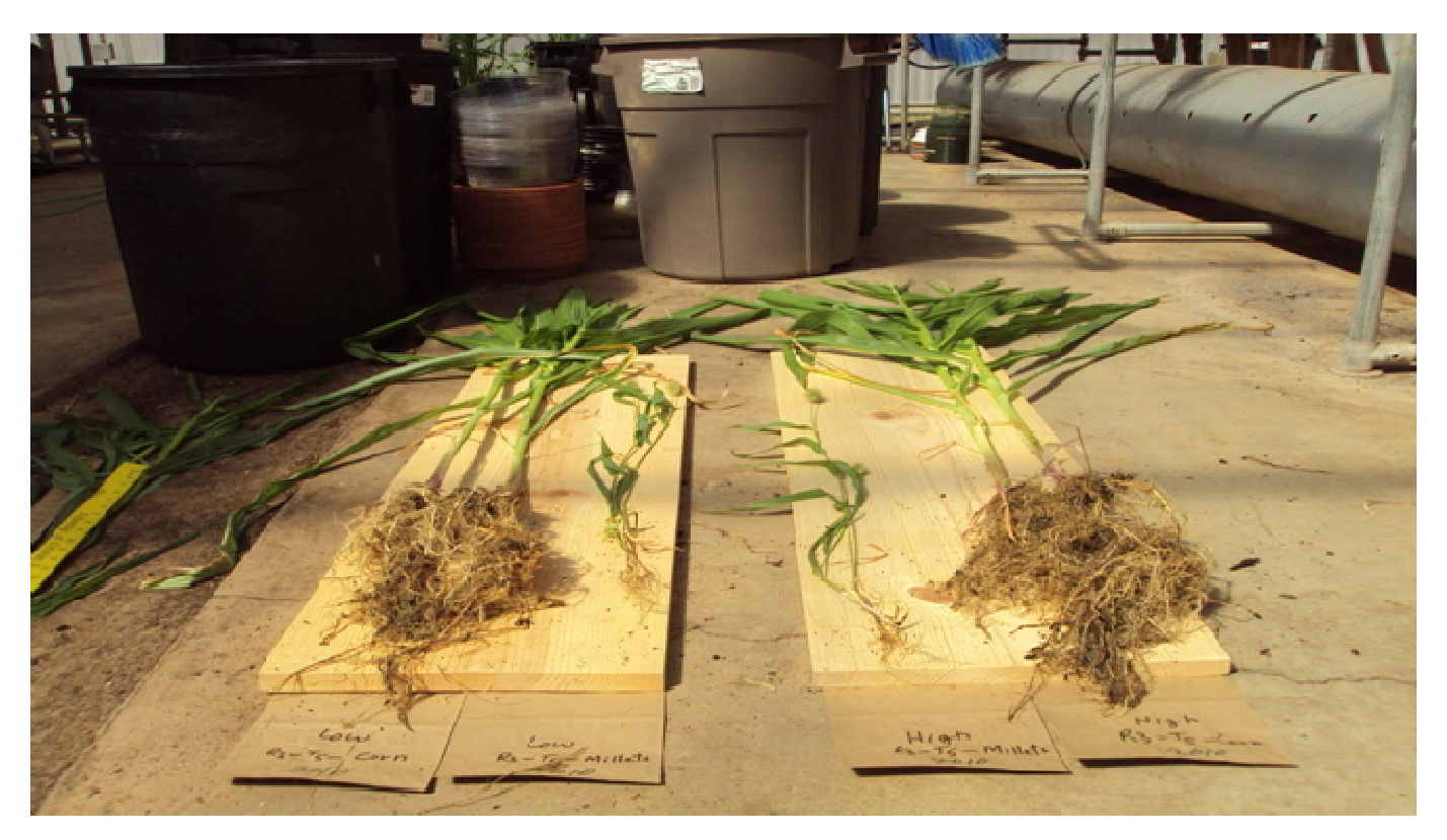
Figure 8. Corn and foxtail millets grown together in mixed stand under low (left) and high (right) water level 90 days after emergence.