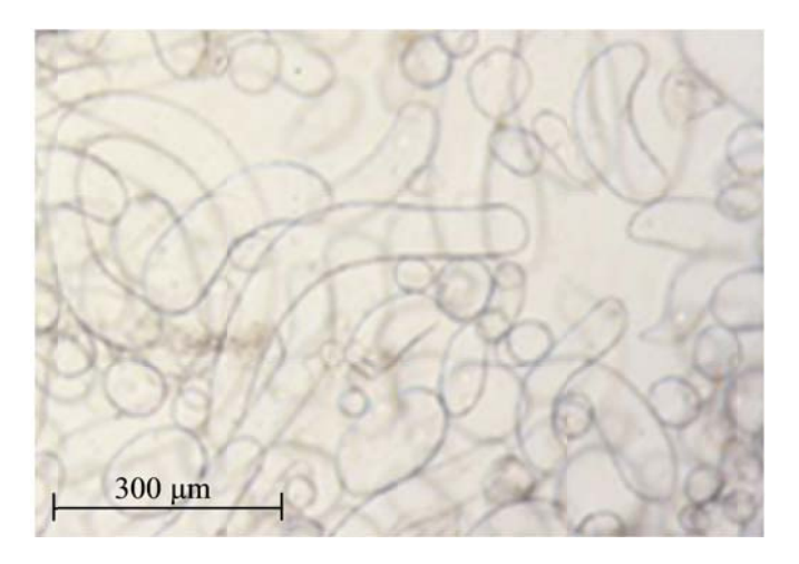
Figure 1. Suspension cultured cells of P.\ sidoides in a medium with 1 mg/L 2,4-D, 0.2 mg/L K and ascorbic and citric acid (50 mg/L each).