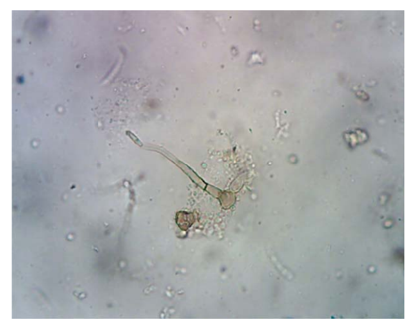
Figure 2. Glandular trichomes of S. virosa.