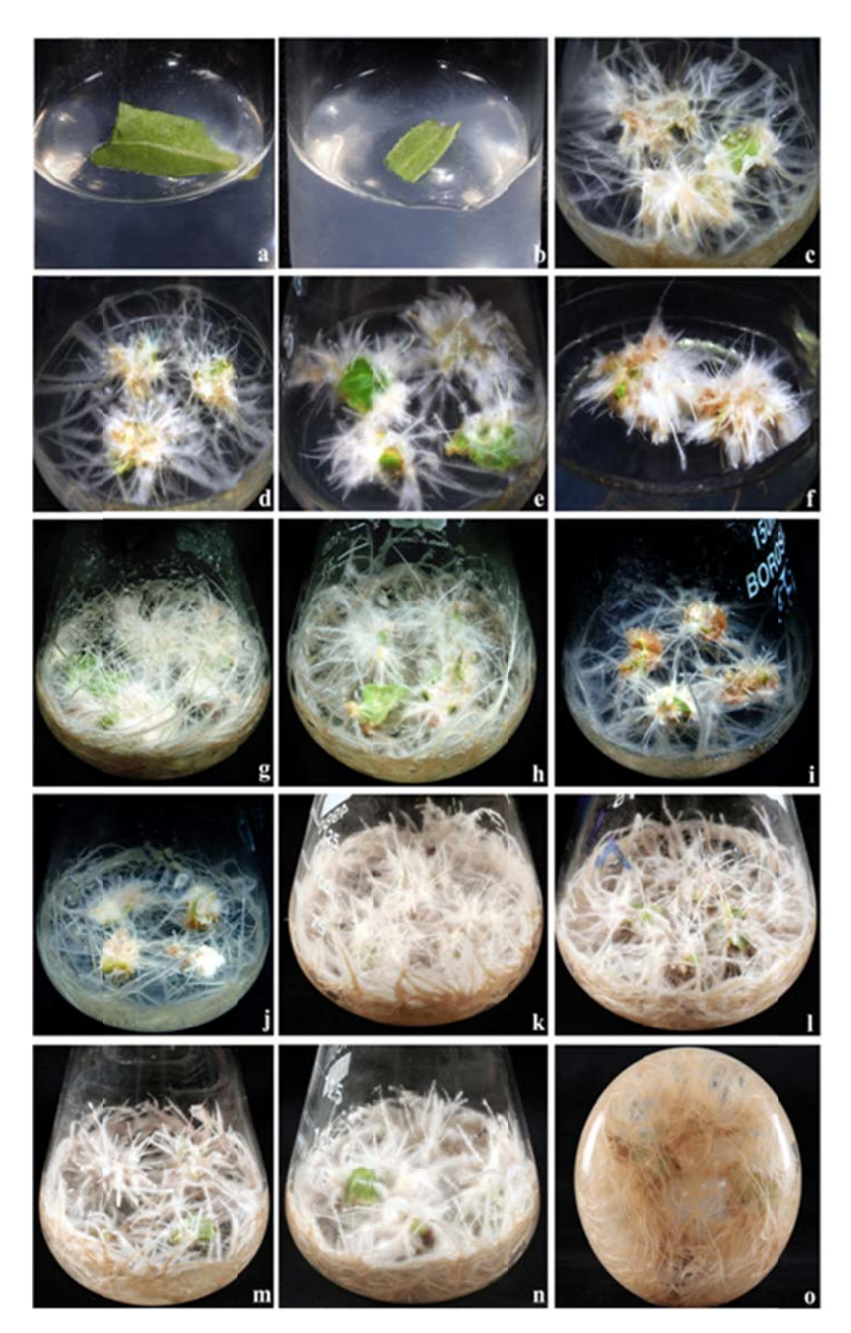
Figure 1. High frequency of hairy root induction from leaf and cotyledon explants of W. somnifera. a and b . Leaf and cotyledon explants placed on co-cultivation medium supplemented with 3 % sucrose containing 100 µM acetosyringone. c and d . Hairy root induction from leaf and cotyledon explants infected with R1000 strain after 12 days. e & f Hairy root induction from leaf and cotyledon explants infected with A4 strain after 12 days. g & h Hairy root formation from leaf and cotyledon explants infected with R1000 strain after 16 days. i and j . Hairy root formation from leaf and cotyledon explants infected with R1000 strain after 16 days. i and j . Hairy root formation from leaf and cotyledon explants infected with A4 strain after 16 days. k and l . Hairy root formation from leaf and cotyledon explants infected with R1000 strain after 18 days. m and n . Hairy root formation from leaf and cotyledon explants infected with R1000 strain after 18 days. o . Bottom view of hairy root formation from leaf explant infected with R1000 after 12 days.