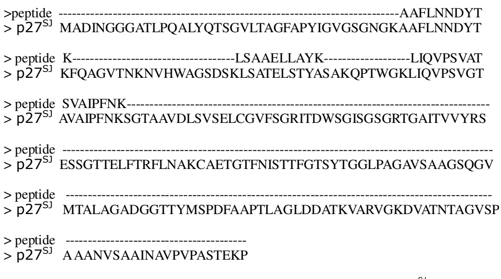
Figure 3. The three short peptides of \beta -EST in Chinese cabbage are blasted to p27<sup>SJ</sup>.

short peptide sequences were obtained which were amazingly identical to those of >2 and >3 above.