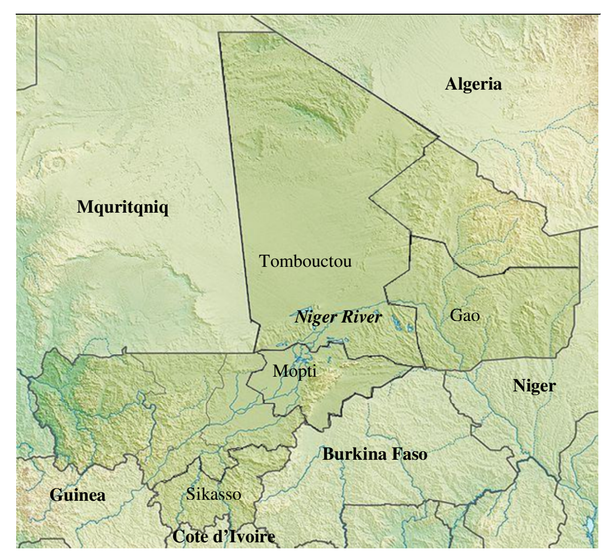
Figure 1. Map of Mali and geographic locations (Tombouctou, Gao, Mopti and Sikasso) where RAM accessions were collected.

Table 2. List parameters for genetic analysis of location and growing condition based RAM accessions with their respective mean value.