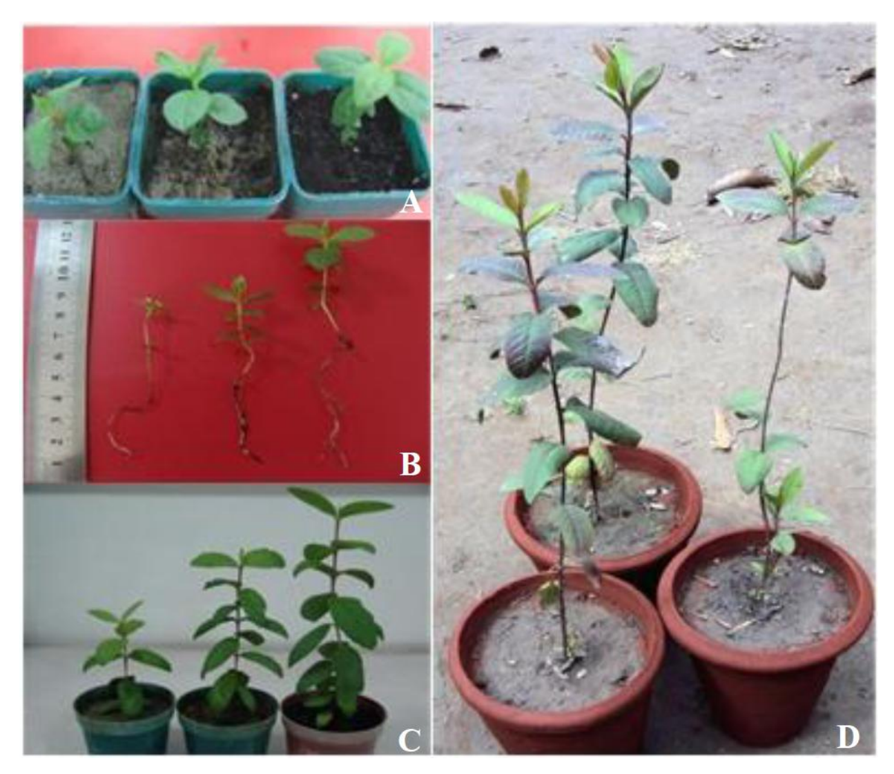
Figure 3. Plant growth behavior in vitro regenerated plants of guava cultivars in response to different potting media which includes sand, compost and silt + compost from left to right respectively (A), Root and shoot development of in vitro raised plants (B), plant growth after one (C) and three (D) months in green house.

Means sharing different letters in columns are significantly different from each other at P < 5% using DMR test. DMR, Duncan's multiple range test.