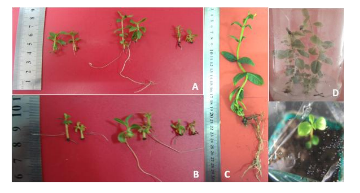
Figure 2. Effect of sucrose (30, 45, and DE 60 g<sup> \Gamma 1</sup> from left to right respectively on plant growth developed from: A, shoot tip; B, single node cuttings in Guava; C and D, Guava shoot developed on medium with 45 g<sup> \Gamma 1</sup>; E, acclimatization of in vitro raised guava plants.

Means sharing different letters in columns are significantly different from each other at P < 5% using DMR test. ST, Shoot tip; SNC, single node stem cutting.