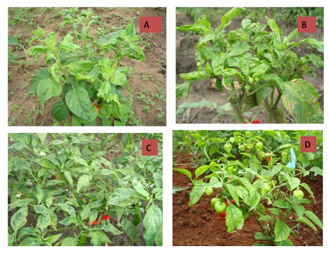
Figure 1. Viral disease symptoms observed on pepper in the farmers' fields. A= Sweet pepper plant infected with PVY, PVX, CMV and TEV; B= Hot pepper plant with CMV, PVY, PVX, TEV, PVMV, ToMV, TMV and PMMV; C= Long cayenne plant infected with PVY, PVX, PMMV, CMV and TEV; D= Hot pepper plant infected with PVY, PMMV, CMV and TEV.

and severity of infection varied significantly depending on the location. In general, the disease incidence was highest in Ekiti state (96.67%) in 2010, while Oyo had the least (66.90%) (Table 1). Ondo had the highest incidence in 2011 with 91.67%; followed by Oyo state with 80.17%, Osun had the least with 65.17% (Table 2). The southwest agro-ecological zone of Nigeria had an average disease severity score of 2.9 during the 2010 surveys and 2.8 in 2011. The disease severity was highest in Osun (average severity score of 3.1), closely followed by Ekiti (3.0). The lowest level of disease severity was recorded in Lagos state (2.6) during the 2010 surveys (Table 1). As for incidence, disease severity was highest in Ondo (3.3), followed by Oyo (2.9) during the 2011 surveys (Table 2).