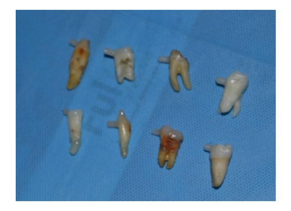
Figure 2. Appearance of cylindrical restorations performed on a group of teeth.