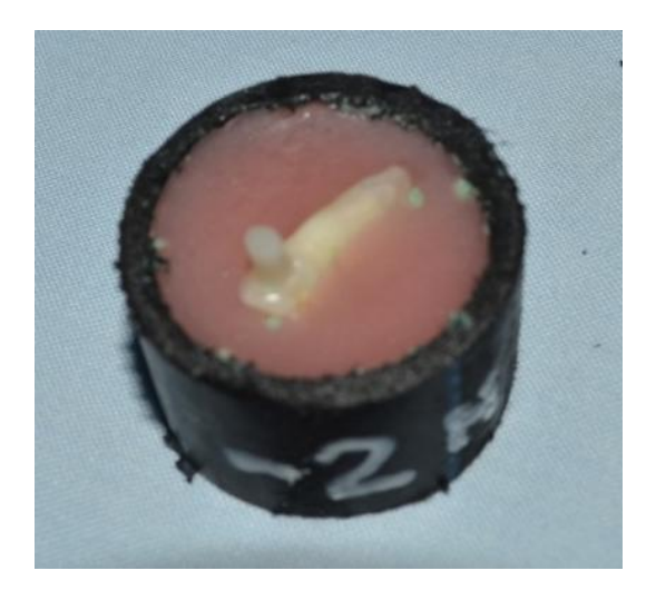
Figure 3. Appearance of a tooth with cylindrical restoration from composite resin fixed for microshear bond strength test.