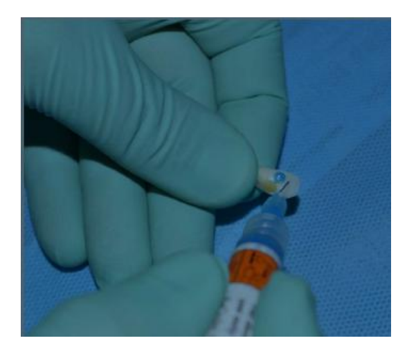
Figure 1. Dentin demineralization with 37% phosphoric acid.