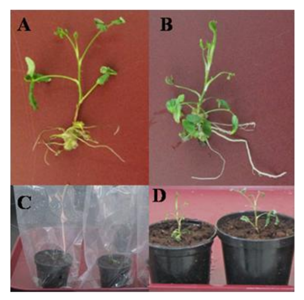
Figure 2. Acclimatization stage of R. hybrida cv. Al-Taif Rose plant. A and B, Plantlets with four to five roots of 3 to 5 cm length. C and D, Plantlets were successfully transferred to pots for acclimatization.