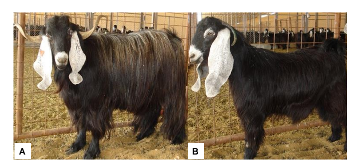
Figure 1. Male of Ardi goat, showing grayish elongated ears, spiral horns, and black coat color (A). Female of Ardi goat, showing grayish elongated ears, semi-circular horns, and black coat color (B).

common native goat populations in the Kingdom are Ardi, Bishi, Jabaly, Hejazy, Najrani and Tohami (Al-Khouri, 1996). Ardi goat is a dual purpose, medium-sized, black colored, well-adapted to arid conditions. The average body weight of the male and female is 51 and 40 kg, respectively (Alamer, 2003; Al-Saiady et al., 2007). Horns are presented in both sexes, where the female's horn is semi-circular while the male's horn is spiral in shape. Ardi has grayish color, elongated and well drooping ears with coarse hairs (Alamer, 2006). Alshaikh and Mogawer (2001) reported the mean birth weight of male and female as 4.29 and 3.63 kg, respectively. Unfortunately, no studies have been found regarding genotypic variability of Ardi goat population in Saudi Arabia. Consequently, studying the genetic diversity of Ardi goat would be an essential step in any conservation and breeding programs of this breed. Therefore, the objective of this study was to evaluate the genetic diversity of Ardi goat in the Central Regions of Saudi Arabia based on microsatellite analysis.