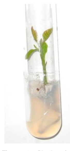
Figure 3 Plantlet from nodal segment via callus on MS with 0.2 mgl<sup>-1</sup> TDZ and then 1.5 mgl<sup>-1</sup> IBA.

seedlings instead of mature trees with good characters. Seedling materials cannot completely represent the mature ones because of the difference of explants condition (Hou et al., 2010). However, for obtaining the physiology mechanism of adventitious root formation of C. sativa Mill. in a comparative short time, this experiment should be the guide of further research. We were successful in plant regeneration in C. sativa Mill. using MS medium supplemented with 0.2 mgL<sup>-1</sup> concentration of TDZ and 1.5 mgL<sup>-1</sup> IBA. This regeneration protocol will be useful not only for further research studies such as genetic cell transformation or protoplast fusion studies, but also for commercial nurseries that could use virus-free plants and agricultural practices to reduce pesticide use and increase yield production.