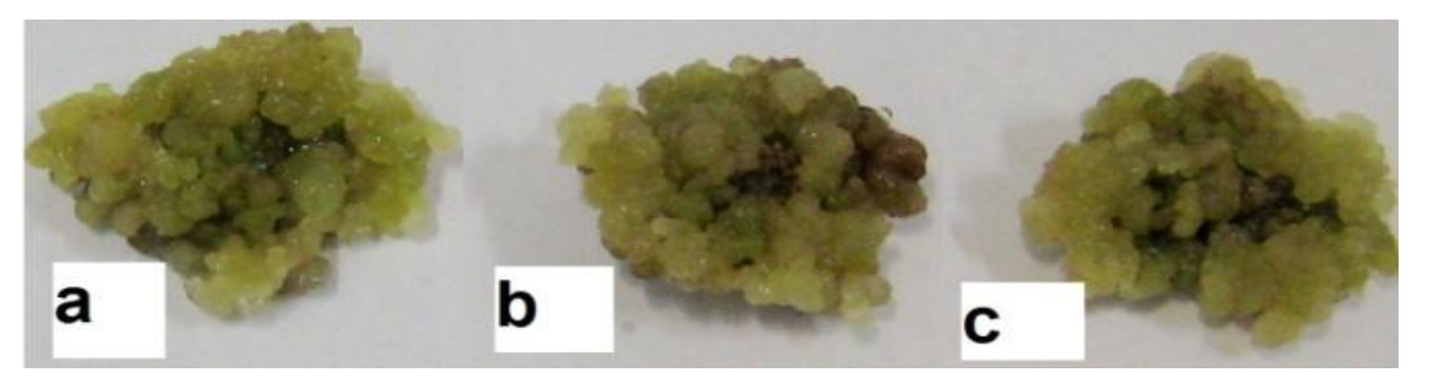
Figure 2. Plant regeneration from callus derived from in vitro cultured nodal and internodal segment of Castanea sativa Mill. (a) Callus formation from node on MS medium with 1 mgL<sup>-1</sup> TDZ after four weeks of culture. (b) Callus formation from root segments on MS medium with 1 mgL<sup>-1</sup> TDZ after four weeks of culture. (c) Callus formation from internodal stem on MS medium with 1 mgL<sup>-1</sup> TDZ after four weeks of culture. TDZ, Thidiazuron; MS, Murashige and Skoog medium.

Data was collected after eight weeks of culture. Explants were cultured on MS medium supplemented with 1 mgL<sup>-1</sup> TDZ. Values represent the mean \pm S.E. Means following the same letter within columns are not significantly different according to Student-Newman-Keuls multiple comparison test (P<0.05). TDZ, Thidiazuron; MS, Murashige and Skoog medium.