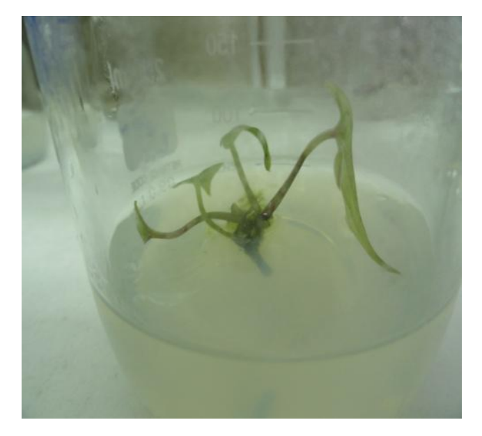
Figure 2. Multiple shoot regeneration.