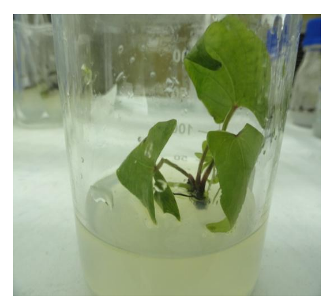
Figure 3. Showing Growth after 45 days.