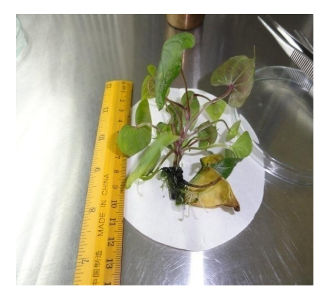
Figure 5. Showing Shoot number in regenerated plants.

cytokinin required optimal quantity in many genotypes but addition of low concentration of auxin with cytokinin triggered shoot proliferation (Sengupta et al., 1984). In this study, low concentration (1.5 mg/L) of kinetin with high concentration (2.0 mg/L) of IAA induced shoot proliferation; further increase of kinetin concentration after optimal concentration (1.5 mg/L) decreased shoot length. The result was supported by this work which shows that suppression of kinetin increases shoot length, node number and root length (Jha and Jha, 1998). In Dioscorea composita only auxin NAA, IAA and IBA at 1.25 and 2.5 mg/L account for promotive effects of in vitro shoot growth (Ondo et al., 2007).