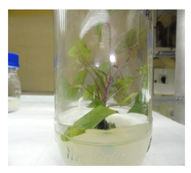
Figure 4. Showing Growth after 75 days.

cytokinin required optimal quantity in many genotypes but addition of low concentration of auxin with cytokinin triggered shoot proliferation (Sengupta et al., 1984). In this study, low concentration (1.5 mg/L) of kinetin with high concentration (2.0 mg/L) of IAA induced shoot proliferation; further increase of kinetin concentration after optimal concentration (1.5 mg/L) decreased shoot length. The result was supported by this work which shows that suppression of kinetin increases shoot length, node number and root length (Jha and Jha, 1998). In Dioscorea composita only auxin NAA, IAA and IBA at 1.25 and 2.5 mg/L account for promotive effects of in vitro shoot growth (Ondo et al., 2007).