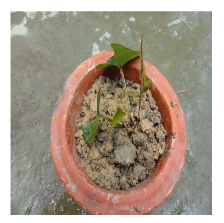
Figure 6. Regenerated plants established in pots.

length. Explants cultured on media (MS + 2.0mg/L IAA + 1.5 mg/L Kn) showed highest shoot length within three month. Auxin (IAA) was very effective in bud breaking and shoots formation. Number of shoot induced per explant by the effect of IAA (2.0 mg/L) was also very satisfactory (Figure 5). Kinetin (1.5 mg/L) with IAA (2.0 mg/L) enhanced shoot multiplication and also increased number of node.