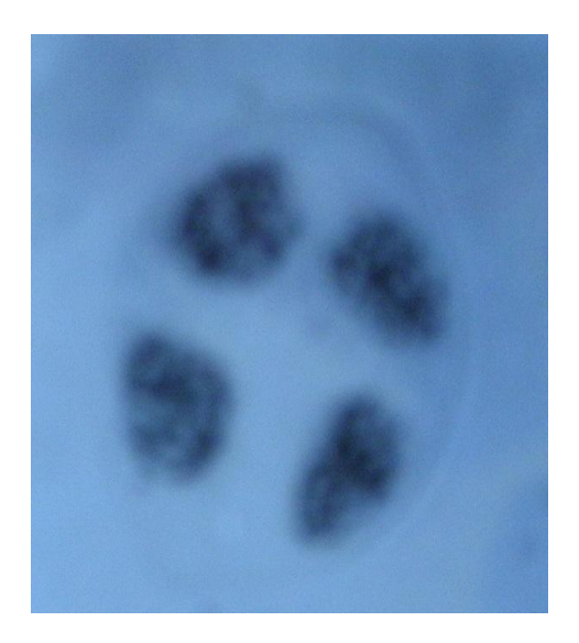
Figure 4. Telophase II of meiosis in E. abyssinicum showing 4 daughter nuclei (tetrads formation) (Mag.x200).

however more or less morphologically similar. In all, nine chromosome-pair members (1, 2, 4, 6, 7, 8, 9, 10, 11) showed morphological differences of unequalness of chromosome arms of varying degrees, while 3 pairs (3, 5 and 12) are more or less morphologically similar (Figure 2). The chromosomes were all median (m), sub-median (sm) and sub-terminal (st) according to the classification system of Levin et al. (1964) and Oyewole (1975). Thus, the population of E. abyssinicum studied has 2n = 24 chromosome complements with karyotype formula of 6 m + 8 sm + 10 st (Table 2).