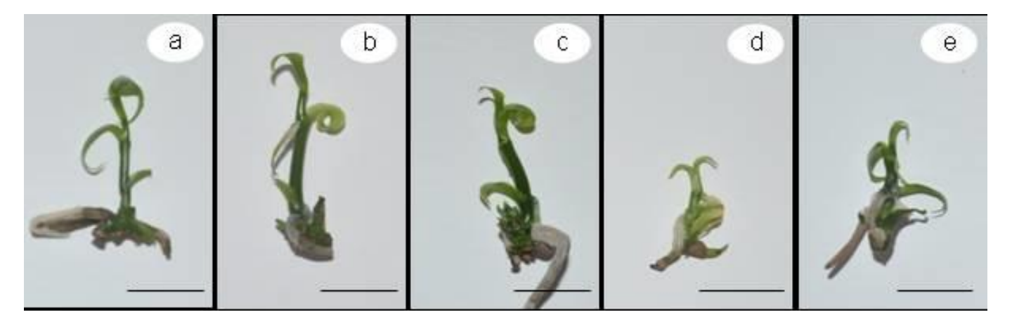
Figure 2. Effect of light quality on in vitro growth of plantlets of Vanilla ( V. planifolia ) after 60 days of in vitro culture. a) Fluorescent Lamp, b) White, c) Blue, d) Red and e) Blue+Red LEDs ( bar = 2.0 cm).

In conclusion, the use of a LED light source was good at promoting the shoot proliferation and growth of vanilla plantlets. W or B+R LED (1:1) light may be used as an