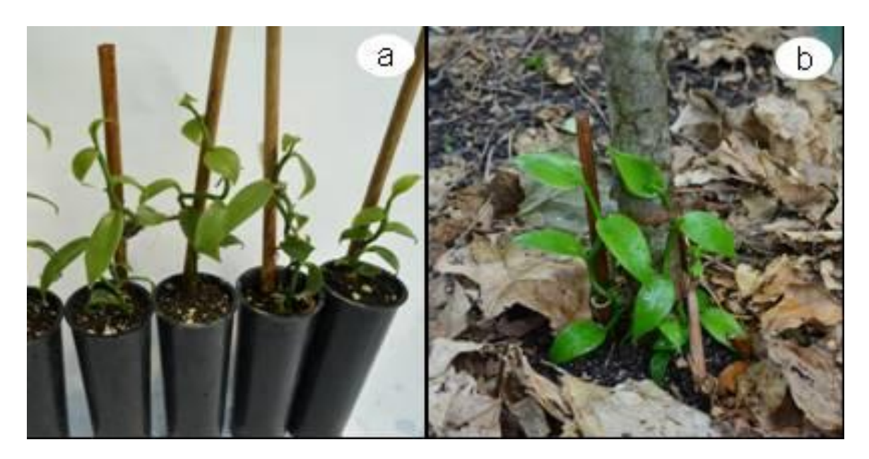
Figure 3. Plantlets of V. planifolia transferred from in vitro condition. a) plantlets in the process of acclimatization in the greenhouse after 30 days and b) plantlets growing in shady forest floor (natural habitat) after 60 days.

Abbreviations: FL = Fluorescent Lamp; W = White LED; B = Blue LED; R = Red LED and B+R = Blue and Red LEDs. Values followed by different letters denote statistically significant differences (Tukey, p \le 0.05 ). Data represent mean \pm SE .