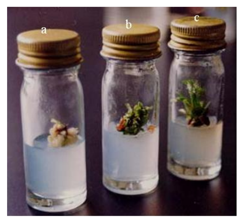
Plate 1. (a) Callus initiation, (b) organogenesis, (c) advanced regeneration.

bromide fluorescence, a portion of 5 µl of DNA from each sample was mixed with 5 µl of 1X gel loading dye III (0.01% bromophenol blue (w/v), EDTA pH 8.0 (0.5 M) and 50% glycerol (v/v) and run in 2% agarose gels containing ethidium bromide (0.5 µg/ml) buffered in 1X TBE [(1 M Tris – HCl pH 7.5), 1 M boric acid and 0.5 M EDTA (pH 8.0)] in a horizontal electrophoresis apparatus. DNA was also loaded and the gels run at 80 V for 1.30 h. Gels were viewed under an ultraviolet (UV) transilluminator Bio Doc-It<sup>TM</sup> System and photographed using its UVP printer (Mitsubishi). DNA concentration of the sorghum samples was estimated by comparing DNA band size and ethidium bromide staining intensity of the test 1 kb molecular weight marker.