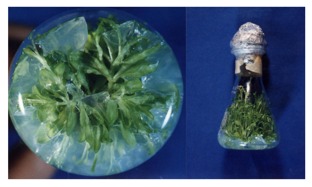
Figure 1. High shoot proliferation in 'Rotem' at second subculture. Left: bottom of flask view, Right: front view.

Means followed by the same letters (small letters for means and capital letters for total means) are not significantly different according to DMRT at 1% level.