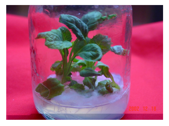
Figure 1. Kan-resistant transgenic plant in root regeneration medium.