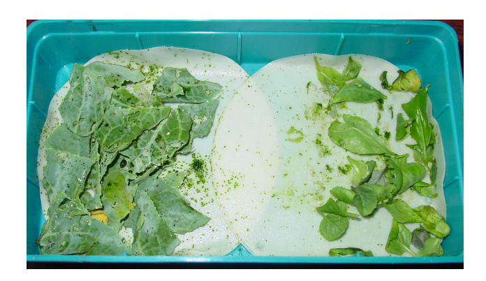
Figure 4. Preliminary insect-resistant assay of transgenic plants. The left leaves were detached from non-transformed plants, and the right leaves were detached from transgenic plants.