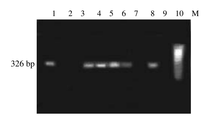
Figure 2. PCR detection of transgenic plants. M: DNA marker, 1-7: genomic DNA of transformed plant, 8: non-template (negative control), 9: plasmid pGA643 (positive control), 10: genomic DNA of non-transgenic plant (negative control).

precultured 2 and 3 days respectively before they were inoculated with agrobacterium . This decreased the number of explants which turned brown. The effect of preculture for 3 days was better.