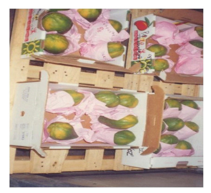
Figure 3. The papaya samples are arranged in a fruit expedition cardboards

Observations take place inside the enclosed cold room (conservation surrounding wall), safe from the solar light and with the help of torchlight. There are four stages of maturity of the papaya: