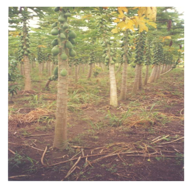
Figure 1 . Papaw - trees and papaya fruits.

- : Standstill + : Backward + + : normal + + + : More marked.