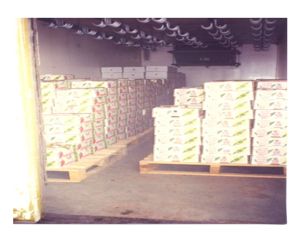
Figure 2. Conditioning in a container of the cardboards of papaya (conservation surrounding wall).