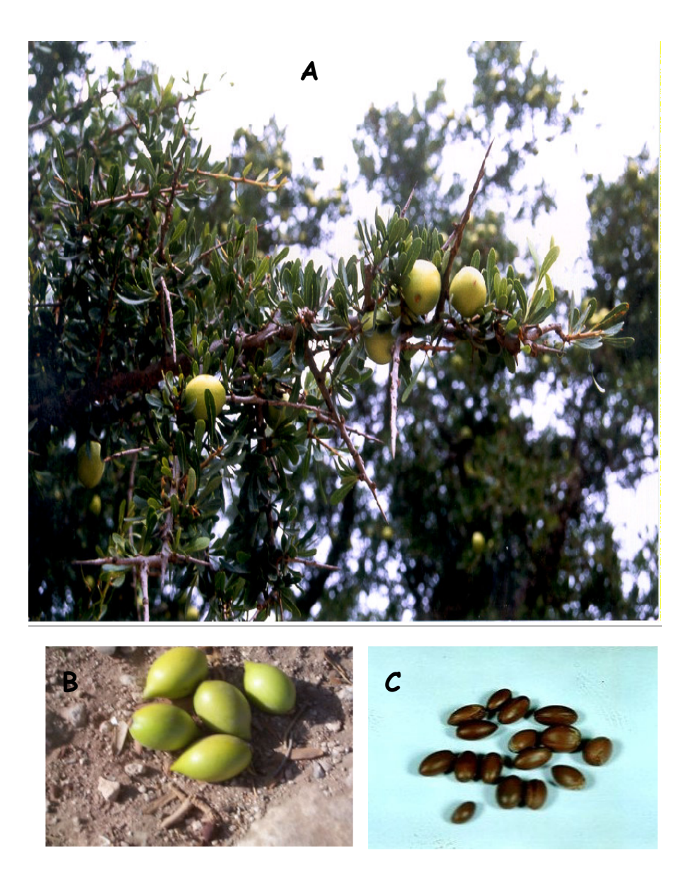
Figure 1. Argan tree (A), fruit (B) and seeds (C).

water and thus help retain the soil, preventing erosion and limiting the advance of the desert. Under and around the trees, flora and fauna thrive and in turn create an ecodiversity crucial to this region. Today, the Argan Region is about 820,000 hectares, or 70% of the wooded surface in south-western Morocco where annual precipitations do not exceed 300 mm, and like most tropical fruit trees, it is multi-purpose. Mainly women carry out collection, local processing and trading activities. However, in less than a century, more than a third of the argan forest has