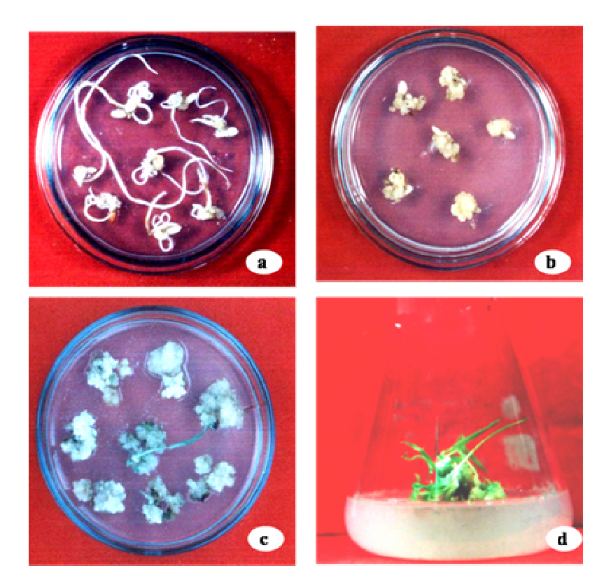
Figure 1. The different in vitro stages of inoculated deepwater rice cultivars. (a) 14-Days old callus, coleoptile and radicle attached with scutellum on MS based medium supplemented with 2.0 mgl<sup>-1</sup> 2,4-D. (b) MSS-derived embryogenic callus from cultivar HA-2 on MS based callus induction medium. (c) 38-Days old greenish, compact and well proliferated embryogenic callus from MSS of cv. HA-1 on 1% (w/v) agar semi-solidified regeneration medium. (d) 44-Days old tiny shoots on the same medium with 0.8% (w/v) agar from cv. HA-1 in light condition.

depend on a deeper understanding of developmental control mechanisms. The development of a reproducible tissue culture system for efficient plant regeneration via somatic embryogenesis from mature seed scutella of deepwater Indica rice cultivars will be a base line to develop a universal approach for rice transformation. The deepwater rice cultivars used in this study were selected on the basis of commercial importance and availability.