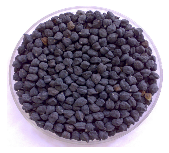
Figure 1. Iranian desi type chickpea.