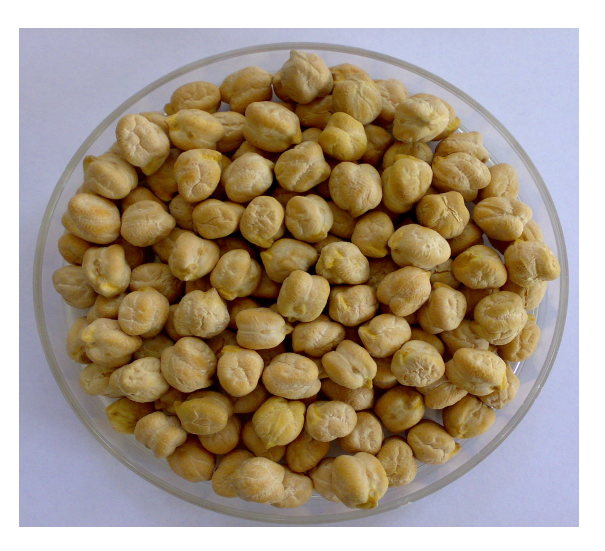
Figure 2. Iranian kabuli type chickpea.

and 4% ash. Chickpea protein is rich in lysine and arginine but most deficient in sulphur-containing amino acids methionine and cystine (Iqbal et al., 2006). Chickpea is also a good source of absorbable Ca, P, Mg, Fe and K (Chavan et al., 1989; Christodoulou, 2005).