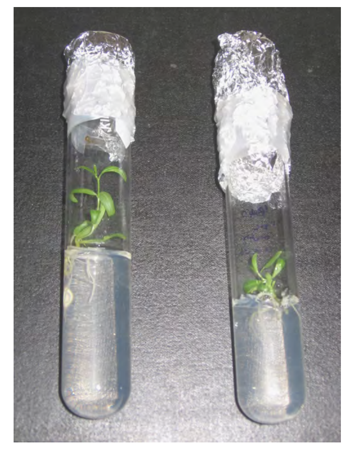
Figure 3. A. orientalis seedlings in the test tubes containing MS medium without plant hormones.

This study shows the preliminary results on the regeneration capability of A. orientalis in tissue culture. In addition, for the first time explants regeneration in A. orientalis plant was also carried out.