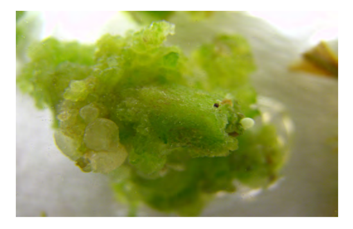
Figure 5. Callus formation on MS supplemented with 2 mg/l BAP plus 0.2 mg/l NAA.