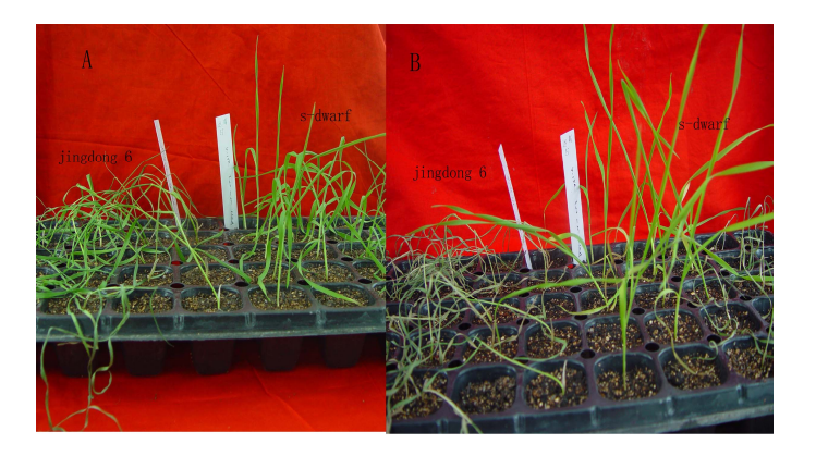
Figure 1. drought tolerance of s-dwarf and Jingdong 6 seedlings. A. Phenotype of the 10-day-old seedlings of Jingdong 6 and s-dwarf without watering for 8 days. B. The phenotype of wilted seedlings of Jingdong 6 and s-dwarf after 7-days re-watering.

Recovery of the dehydrated plants was also determined in our experiments. After all the s-dwarf seedlings were wilted without watering for 11 days, water was given to all the wilted seedlings of s-dwarf mutant and Jingdong 6 for 7 continuous days. The number of recovered seedling is shown in Table 1. From Table 1, it was shown that none of the wilted Jingdong 6 seedlings can be recovered with re-watering for 7 days; on the contrary, 48 percent of wilted s-dwarf seedlings were recovered after 7 days re-watering (Figure 1). It was concluded that s-dwarf seedlings were more resistant to drought resistance.