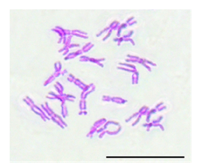
Figure 3. Ski pairs of chromosomes in a partial metaphase spread. This configuration is commonly the result of long pretreatment of the roots with colchicine. Bar = 20 \, (\mu m) .

slide decrease the cytoplasm segments on metaphase spreads, overheating also reduces the quality of fluorescence signals in FISH.