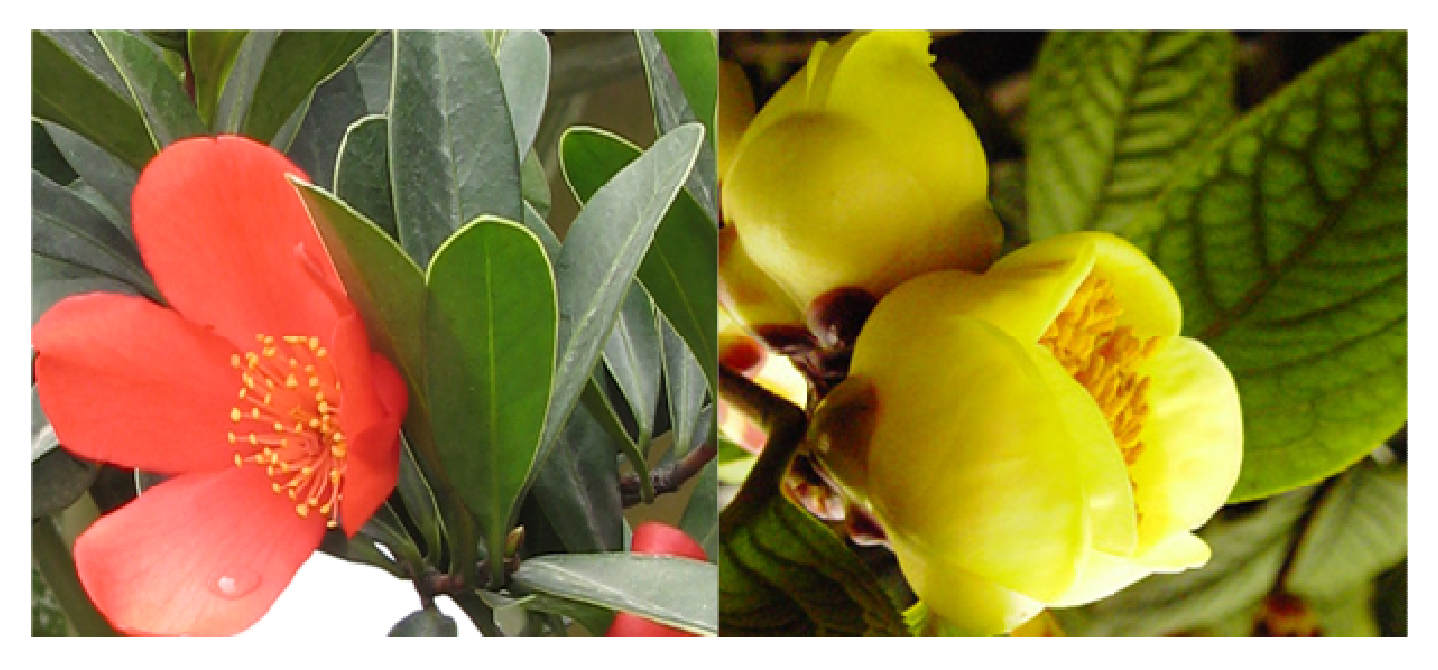
Figure 3. Morphological traits of two unique camellia varieties (left: Dujuancha (N1); right: Aomai (N2)).