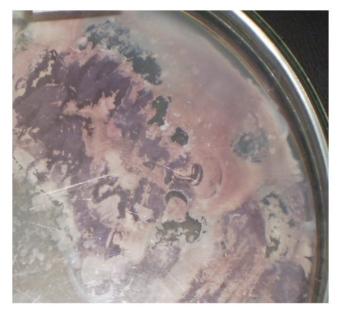
Figure 1. Appearance of brownish precipitate after the application of 0.1 M AgNO<sub>3</sub> in agar plate supplemented with NaH_2AsO_3 (100 µg ml<sup>-1</sup>) in which P. lubricans was growing.

determined by transfer of reducing equivalents from As(III) 200 \mu M 2, 4 -dichlorophenolindophenol (DCPIP) in 50 mM phosphate buffer (pH 7) with 2mM phenazine methosilfate (PMS) after suitable time intervals (Anderson et al.,1992). The protein concentration was estimated by the Lowry method (1951) after hydrolysis of the cells in 0.4 N NaOH at 100 °C for 10 min. Bovine serum albumin was used as standard.