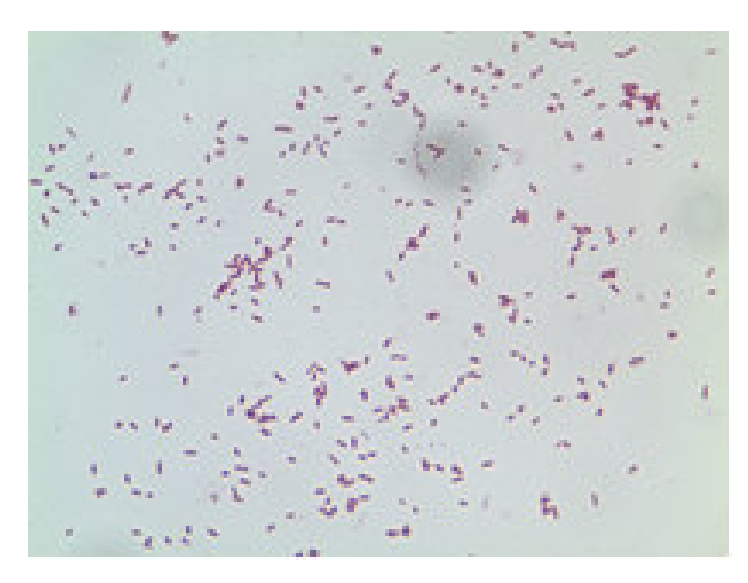
Figure 2. Gram's staining showed the isolate was gram-negative bacilli arranged in single and pairs.