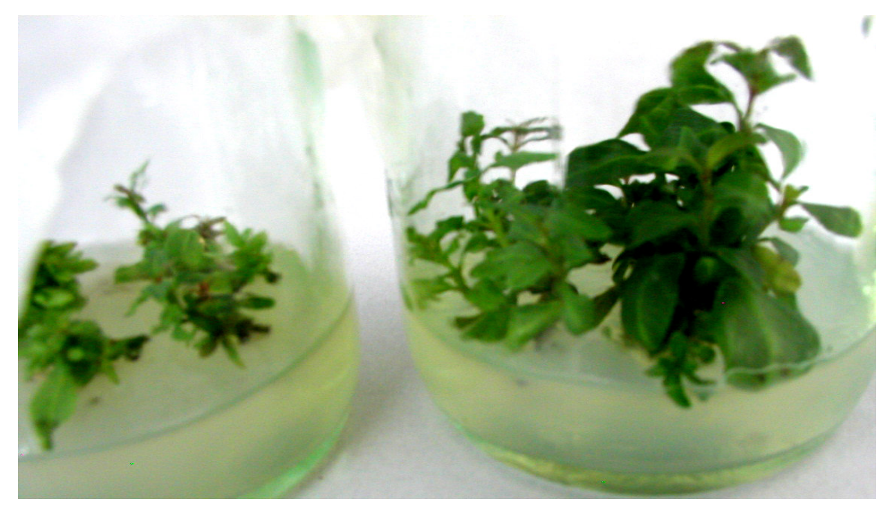
Figure 1. Eucalyptus globulus plants and the ones treated by colchicine. Note: Plants in the left bottle were Eucalyptus globulus and plants in right one were the Eucalyptus globulus polypoid.

of colchicine had the greatest effect of the stimulation and the rate of mutation was highest. Because of the highest mortality rate (60%) at the concentration of 0.5%, taking into account the induced efficiency, higher concentrations were not been conducted in the experiment. Hence, a combination of 0.5% colchicine and treating multiple shoot clumps for 4 days was the most appropriate condition for E. globulus polyploidy induction.