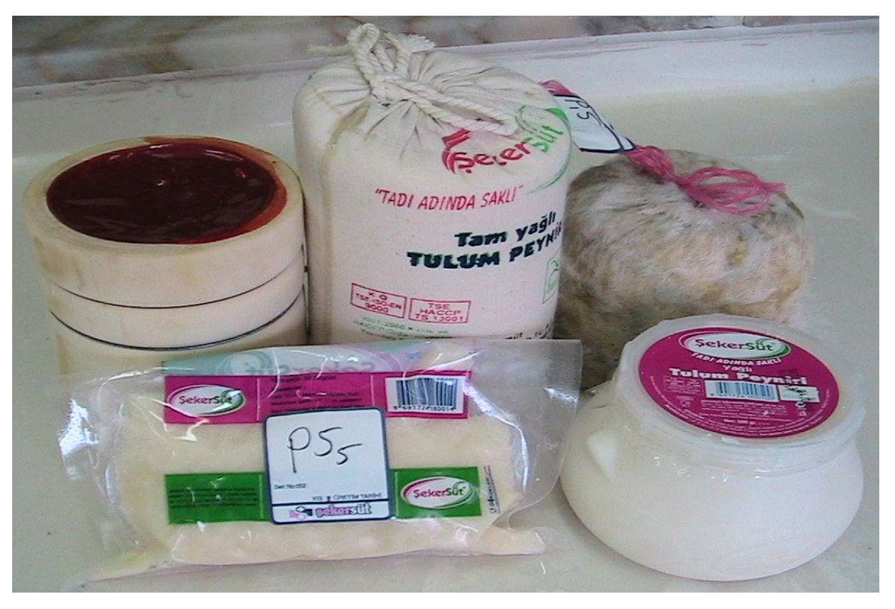
Figure 1. Packaging materials used in cheese production.

subsp. thermophilus + Lactobacillus delbrueckii subsp. bulgaricus ) and rennet were obtained from Peyma-Chr Hansen's Inc. (Denmark). Sheepskin, plastic containers (Pektim Inc.), poplar wood, percale cloth (Elit Inc.) and polyethylene vacuum packaging (Bardakçi Plastic Inc.) were used for packaging cheese samples (Figure 1).