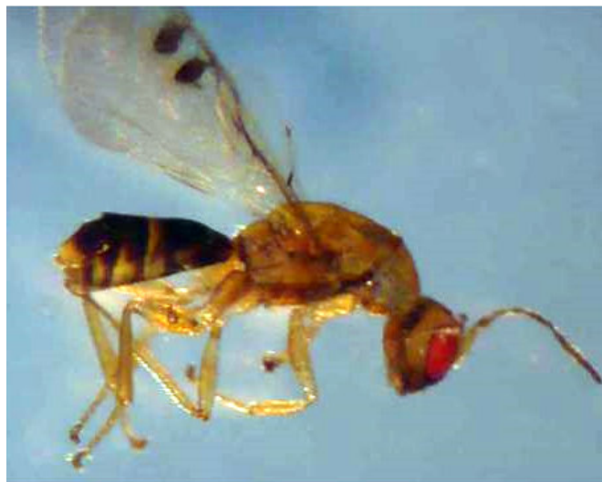
Figure 3. Male lateral view.

and closed below, the stigma is conspicuous and its uncus is distinct, and the stigma is 1.5 times as long as it is broad (minus uncus). Moreover, the hind coxae are dorsally striated and hairy, and their relative lengths are 40, 45, 75 and 60 for hind coxae, femur, tibia and tarsus, respectively.