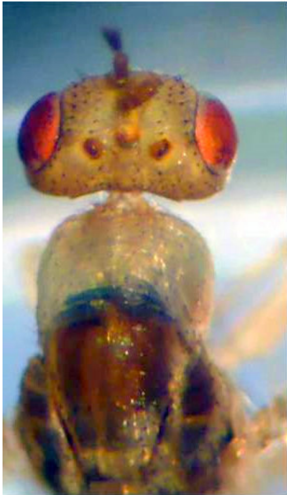
Figure 4. Female dorsal view.

are of equal length with a double row of long sensillae. The clava is 2.1 times as long as the preceding segment, and the forewing (Figure 6) is 2.10 times as long as it is broad. Nonetheless, the stigma which is relatively much darker and distinct its uncus, is 1.35 times as long as it is broad (minus uncus).