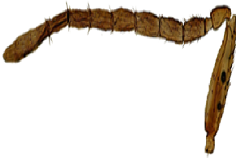
Figure 9. Female antenna.

body and 1.33 times as long as the gaster (ovipositor sheath is 0.7 times as long as the body and 2.1 times as long as the gaster in M. atlanticus ). The first funicular segment is as long as the pedicel (that is, 1.3 times as long as the pedicel in M. atlanticus ).