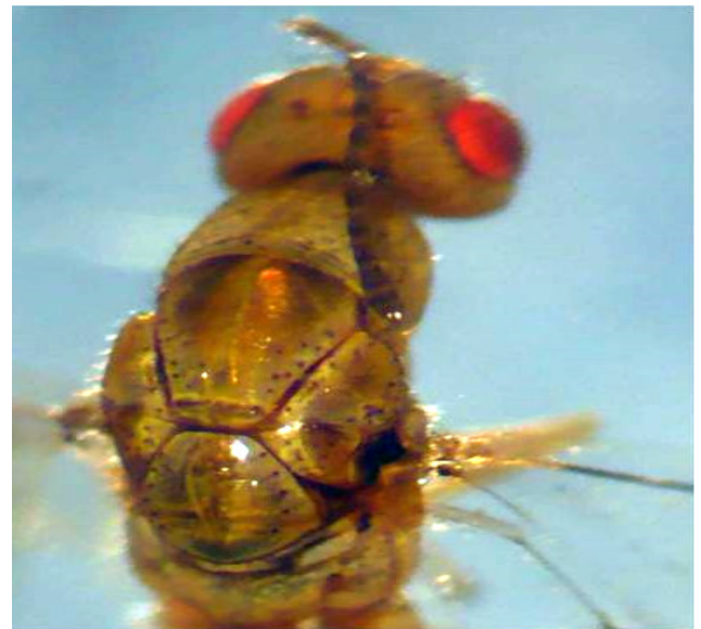
Figure 5. Female head and thorax dorsal view

Paratypes comprised 10 females and 5 males (on card) and 18 females and 10 males (in alcohol) with the same data as the