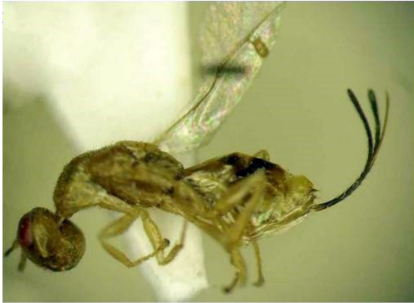
Figure 2. Female lateral view (on card).