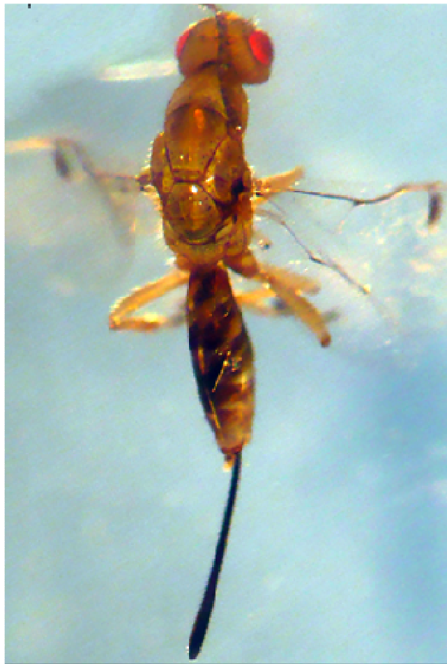
Figure 1. Female dorsal view.

Colour: The body is yellowish, with brownish black patches on the ventral side of the gaster. The tegula has the same colour with thorax, gaster has brownish patches laterally and ovipositor sheaths are brownish black, scape and pedicel yellowish. The eye is brownish red, the median ocellus transparent and the lateral ocellus is brownish. The wings hyaline have veins and are pubescence brown (Figure 7), the stigma is blackish brown and the uncus is transparent. Similarly, the legs have the same colour as the body.