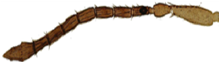
Figure 8. Male antenna.