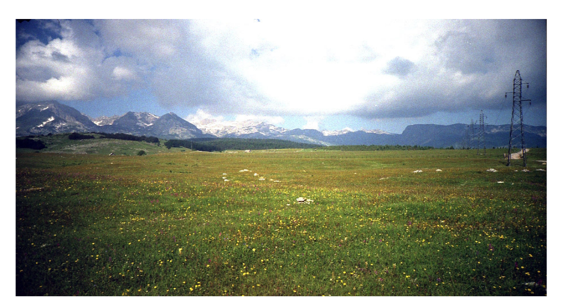
Figure 2. Grassland of the Lake Plateau at 1350 m.

activities (urbanization and exploitation of nature) have exerted a greater negative impact on the highly complex and important forests and grassland ecosystems than on water quality resources, soil resources and loss of biodiversity via the collection, use and trade of comercially important species. Overall, the mountain and sub mountain meadows and pastures have been significantly negatively impacted in the course of the 20th century.