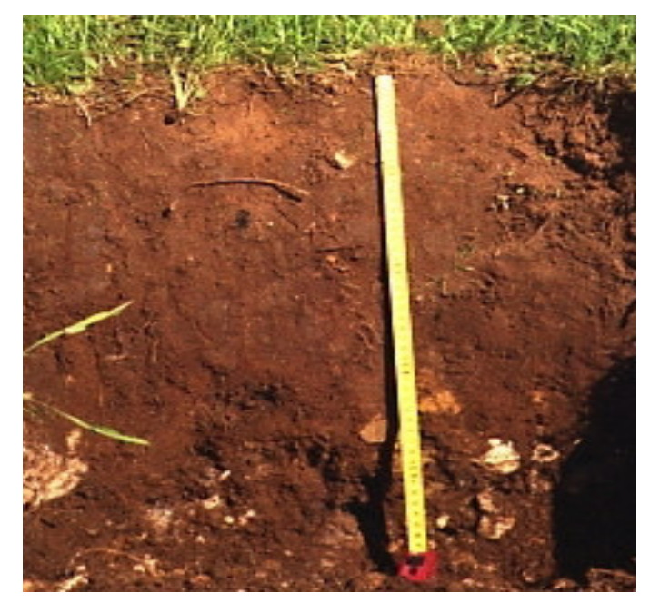
Figure 3. Typical soil profile of Rendzic Leptosol on morainic deposits.

Knežević, 2004). The amount of essential elements in the soil, if found to be low, is considered deficient, while a higher amount is considered toxic. For non-essential metals a gradation of deficiency is not referenced, and are only designated as either optimal or toxic (Adriano, 2001). Knowing the concentration of metals in a soil profile is valuable for many scientific disciplines, but it is most important to understand the relationship between the total concentration of metals and their biological effect (Herbert and Yin, 1998). The availability of heavy metals to plants, primarily depends on adsorption - desorption reactions between the solid phase and the soil solution (Leslie, 2002). The movement of heavy metals through the soil is directly caused by adsorption processes (Vogeler, 2001) and chemical speciation in the soil is important for their activity and is dependent on several factors including the initial concentration, the presence of other ions such as chloride and the degree of organic complexation (Lumsdon et al., 1995). Overall, the impact of aeropollution increases the concentration of metals in the soil, which results in a greater concentration of heavy metals that become available to plants (Påhlsson, 1989).