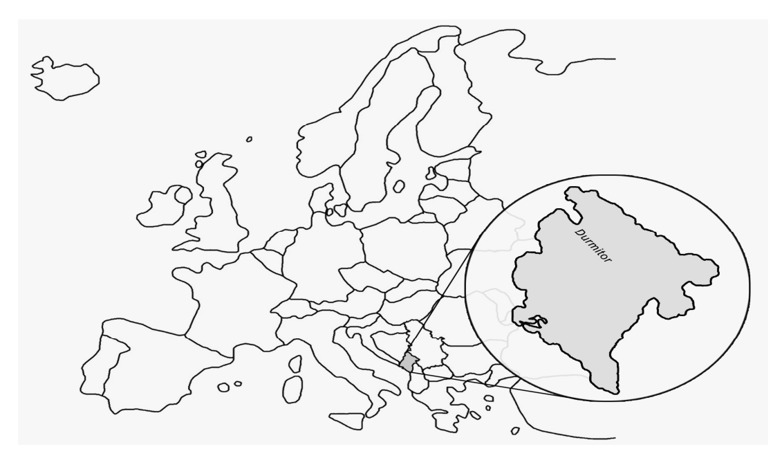
Figure 1. Study area of Mountain Durmitor in Montenegro.