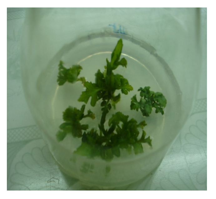
Figure 3. Adventitious shoots elongation.

(MS1-MS5). The best performance occurred on MS medium with 2.0 mg/L BA + 0.2 mg/L IAA (MS7), the inductivity and number of shoots per explant were 100% and 4.37 \pm 0.35 (cotyledonary node A) and 100% and 4.56 \pm 0.34 (cotyledonary node B), respectively (Table 3).