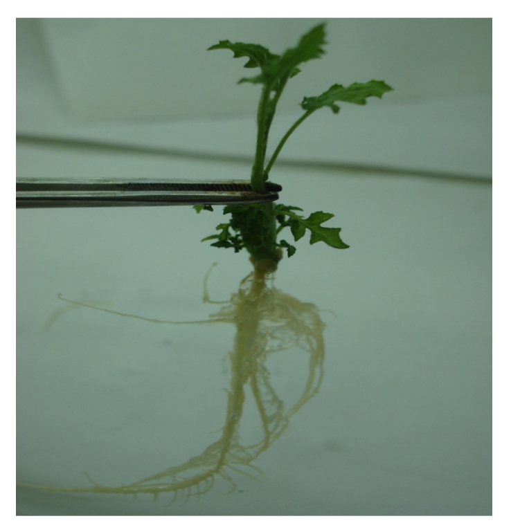
Figure 4. Induction of roots

Flatted and were beneficial for absorbing nutrient. Therefore, proximal cotyledons were the optimal explant screening in this experiment.