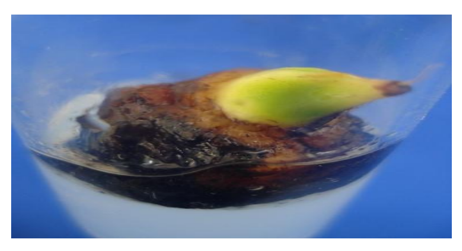
Figure 1. Initiation of shoot formation on MS medium containing 1.0 mg/I BAP (3X).

Means followed by different letters in the same column differ significantly at P=0.05 according to Duncan's new multiple range tests.