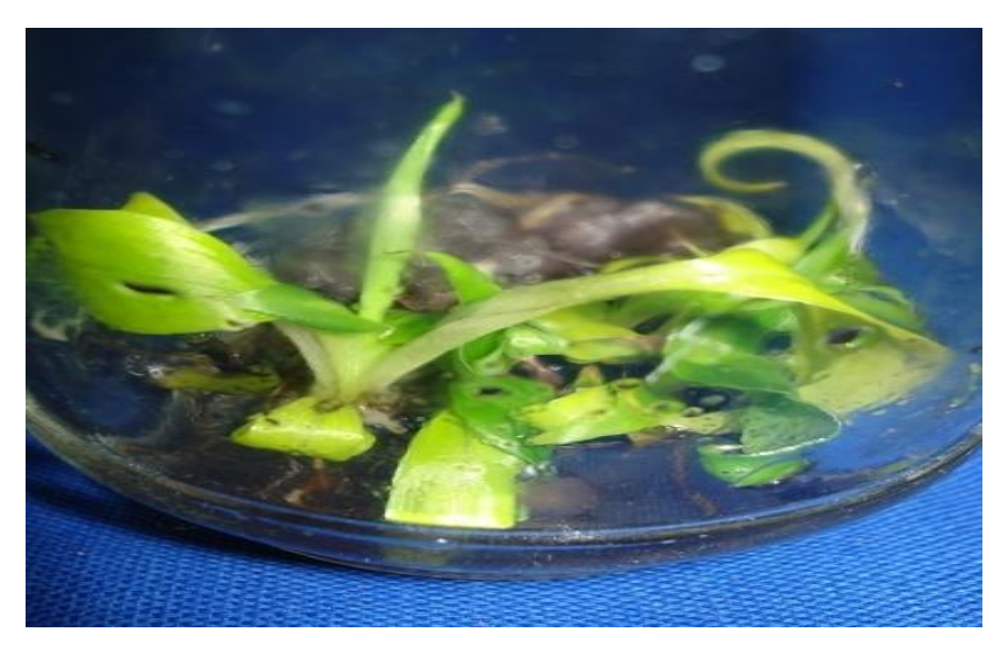
Figure 3. Initiation of shoot multiplication on MS medium containing 1.0 mg/I BAP + 0.25 mg/I Kin. (12 days after inoculation on shoot multiplication medium) (1.5X).