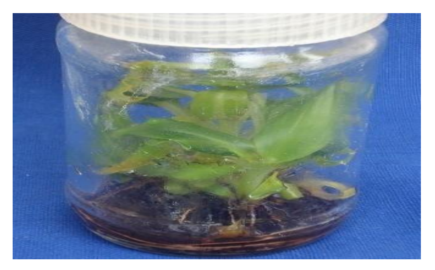
Figure 4 . Initiation of root formation in in vitro developed shoots on MS medium containing 1.0 mg/l IBA + 0.5 mg/l NAA. (7 days after inoculation on rooting medium) (1.0X).

fresh medium (Figure 3). It was also observed that shoot multiplication response was enhanced in liquid medium while solid medium delayed shoot multiplication response. While Rahman et al. (2002) reported that MS medium supplemented with 5 mg/l of BAP and Kin produced the highest number of shoots per explants of cv. Sabri.