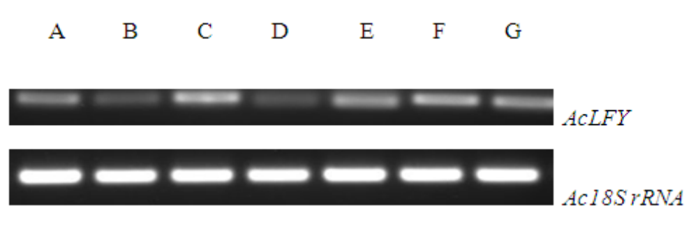
Figure 3. RT-PCR analysis of AcLFY expression pattern in different tissues. RNA transcripts from different tissues. A, apical meristems; B, flesh of young fruit; C, fruit stem; D, bract; E, leaf; F, petal; G, sepal. Ac18S rRNA transcripts were used as the control signals.

meristems and leaf at moderate levels (Figure 3). So, it was inferred that AcLFY gene could be expressed constitutionally.