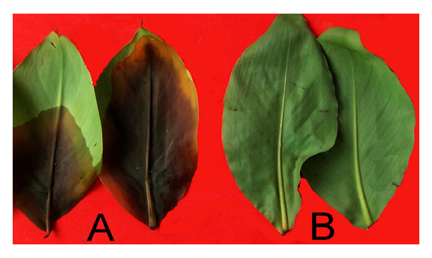
Figure 1. Symptoms appearing on healthy banana leaves after inoculation treatments. A, Leaves injected with Dickeya sp. ( Pectobacterium chrysanthemi ) bacterial suspension; B , leaves injected with distilled water, designed as control.

In this study, PCR primers derived from 16S-23S rDNA internal transcribed spacer (ITS) sequences were designed for the specific detection of Dickeya sp. ( P. chrysanthemi ) (Gurtler and Stanisich, 1996; Kwon et al., 2000). The specificity and sensitivity of the reaction were tested and the PCR protocols were used to detect diseased plant tissues, irrigation water, and infested soil samples collected in the field.