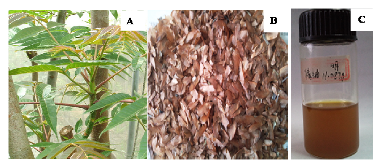
Figure 1. Leaves, seeds and seed essential oil of C. sinensis (A. Juss.) Roem. (A, leaves; B, seeds; C, seed essential oil).