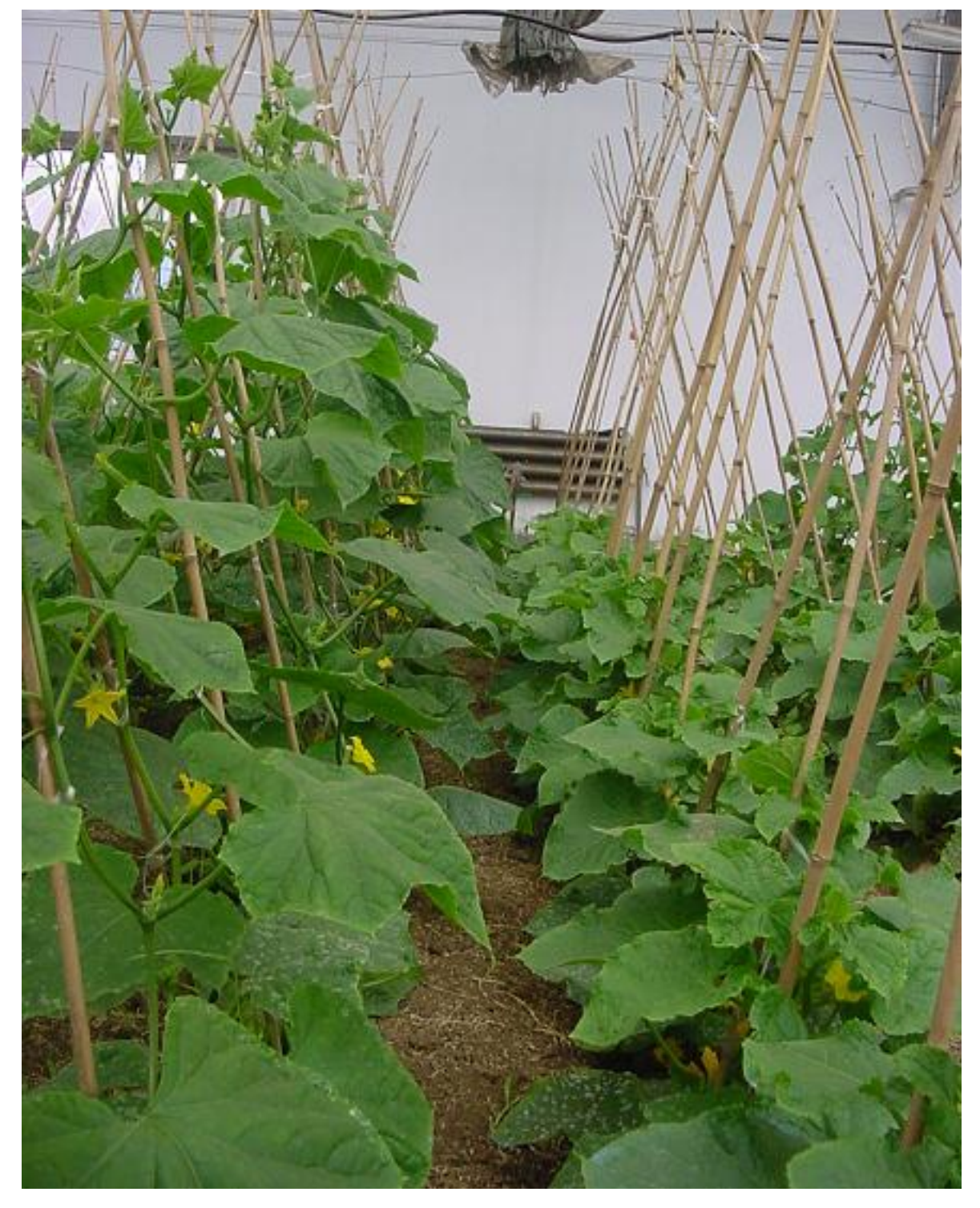
Figure 2. Mature vine (left) and dwarf (right) plants in cucumber (60 days)

difference in morphology. The dwarf line (D0460) has remarkable phenotypes including smaller flowers, less and shorter internodes, earlier flowering, shorter tendrils (Figures 1A and B). Expression of the compact gene was generally not affected by environment. Thus dwarf plants