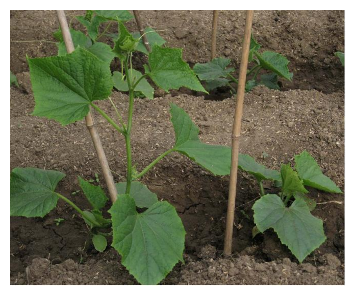
Figure 1. Young vine (left) and dwarf (right) plants in cucumber (20 days).

North Central Regional Plant Introduction Station (Ames, IA, USA). This monoecious dwarf plant was self-fertilize and all of its progenies were dwarf in appearance, suggesting homozygosis. The vine (Figure1B) parent was a typical pure line in plant habit.