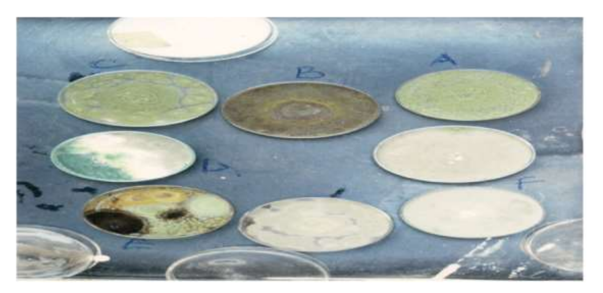
Plate 1. Mixed culture from tannery effluents /chrome buffing dust. A- Aspergillus fumigatus, B- Old culture of Aspergillus niger, C-Aspergillus fumigatus, D- Penicillium sp, E- Aspergillus flavus, Aspergillus niger, Aspergillus fumigatus

A = 0.05, Critical value with (3-1) (3-1) = (2) (2) = 4, Degrees of freedom at \alpha = 0.05 = 9.488, Chi - square test value = 0.01257647, Decision - Do not reject null hypothesis since 0.015 <9.488.