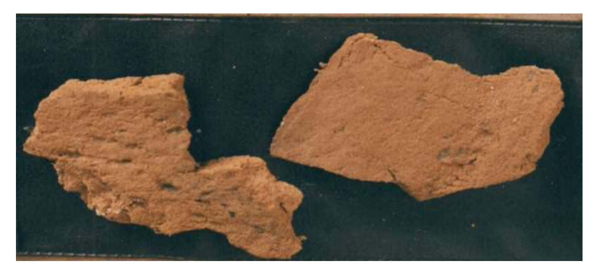
Plate 3. Modified rice husk (MRHM).